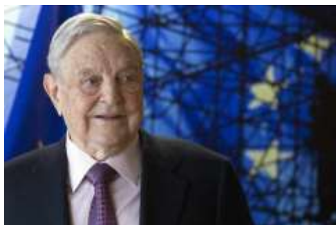
George Soros has donated at least $1 million to The Democracy Integrity Project.

The report even posited that “Russian influence networks” have conspired with “domestic right-wing disinformation networks,” allegedly including Fox News, Breitbart News, The Hill and the Daily Caller, to suppress Democrat voter turnout to help Trump and the GOP candidates he endorses.