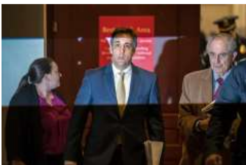
Michael Cohen, Donald Trump's former lawyer, with his attorney Lanny Davis, right. TDIP has pushed a discredited story that Cohen visited Prague to plot with the Kremlin.

This account first appeared in the Steele dossier. But after Cohen offered his passport to disprove it, a new twist emerged: allegations that Special Counsel Robert Mueller had evidence that Cohen's phone pinged a cell tower near Prague at the time. After McClatchy bit on the sketchy tip — which was the lead item in TDIP's Jan. 2, 2019 newsletter to the Washington press corps — Mueller's office took the highly unusual step of issuing a statement warning other reporters off the story, an important detail TDIP ignored.