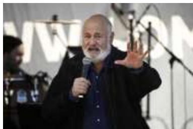
Rob Reiner, co-star of 1970s TV sitcom "All in the Family" and director of acclaimed 1984 rock mockumentary "This Is Spinal Tap," is now a supporter of The Democracy Integrity Project and calls for President Trump's impeachment.

By filing under that tax-exempt status, the organization does not have to publicly disclose its donors. Its latest IRS filing shows reported income of more than $9 million and assets of more than $1.6 million.