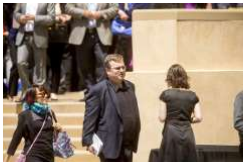
Reid Hoffman, LinkedIn co-founder, who funded New Knowledge, a cybersecurity firm implicated in election meddling. It also worked with The Democracy Integrity Project.

Even as it pushes the collusion theories, TDIP partnered with a cybersecurity firm, New Knowledge, funded by LinkedIn co-founder Reid Hoffman, which used social media strategies employed by Russians to influence the 2016 campaign to defeat GOP candidates for Congress during last year’s midterm elections.