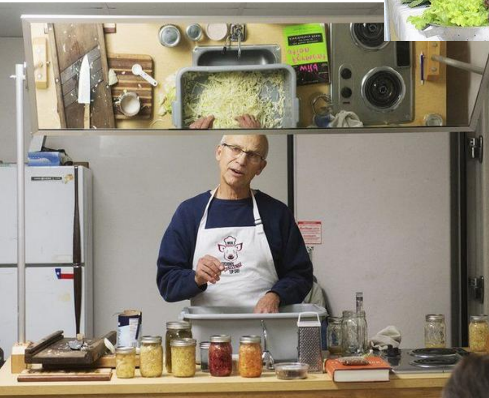
Classes at the kitchen