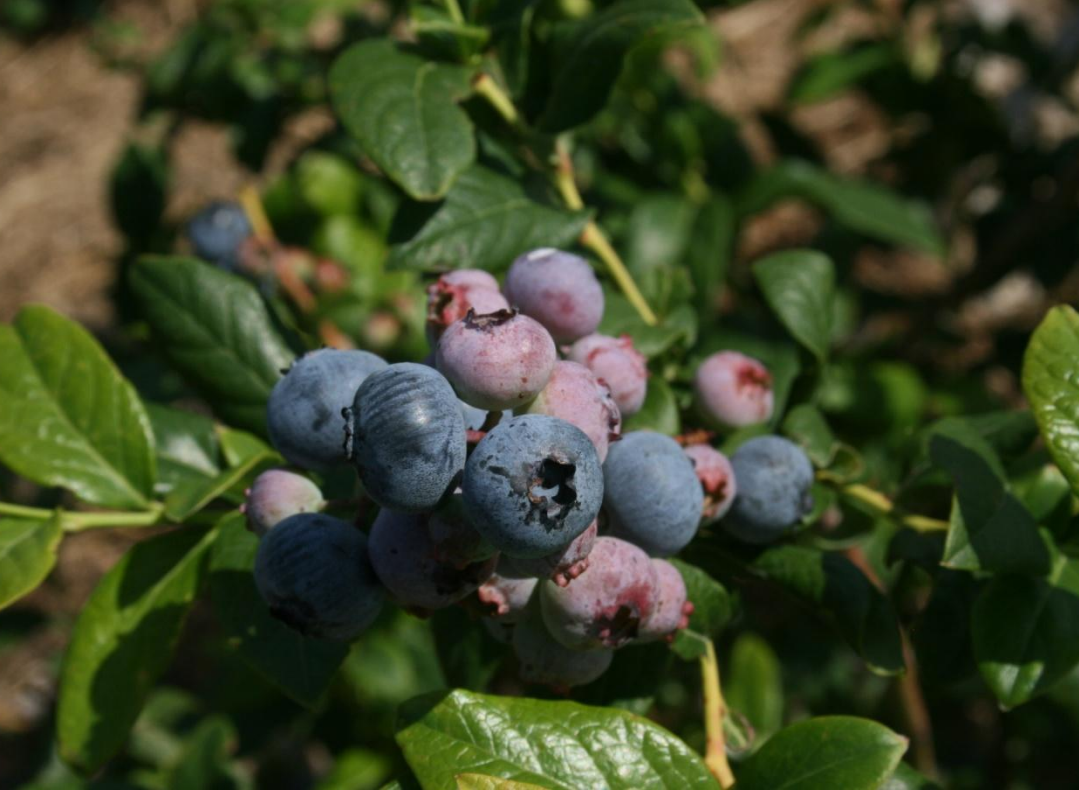
Proud blueberry farmer