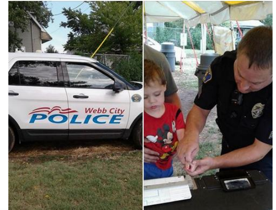
Finger printing for the kiddos going on now.

It is a great week at the Webb City Farmers Market. We are open today (Thursday) 11 to 2 pm at the market pavilion. South Main Street entrance to King Jack Park (106 East Tracy Street).