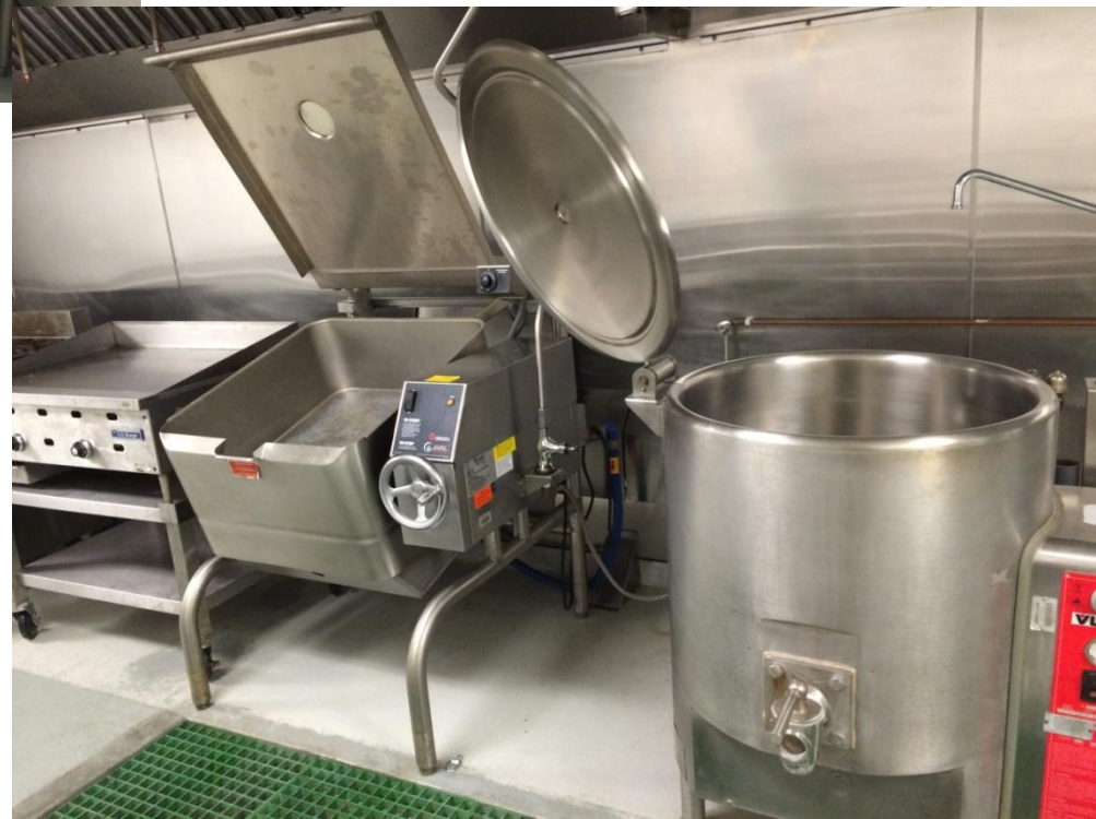
The Market Kitchen.