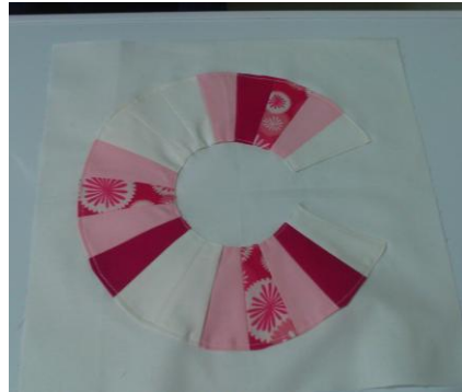
Two spins on the Dresden: one with stripey wedges, the other missing one wedge in a horse-shoe shape.