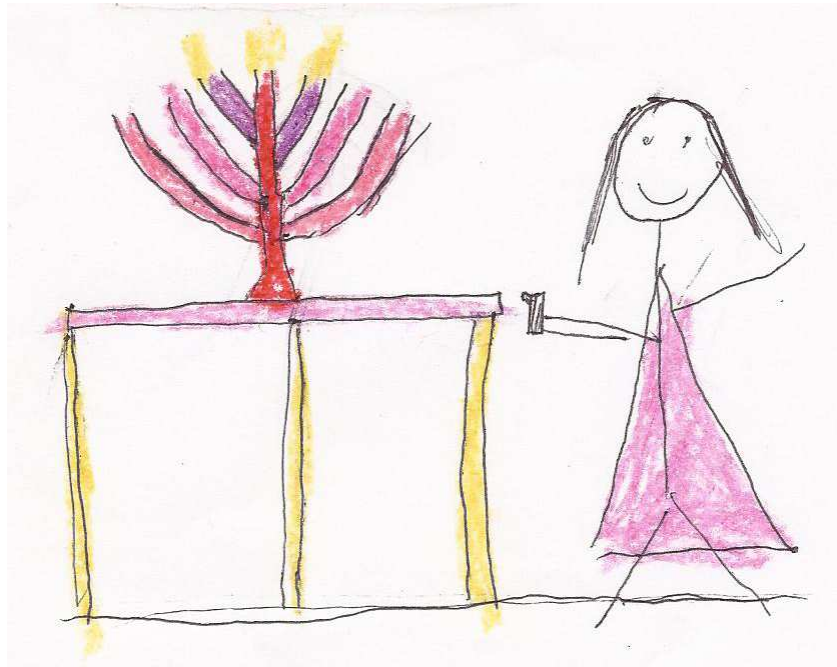
We light the candles.