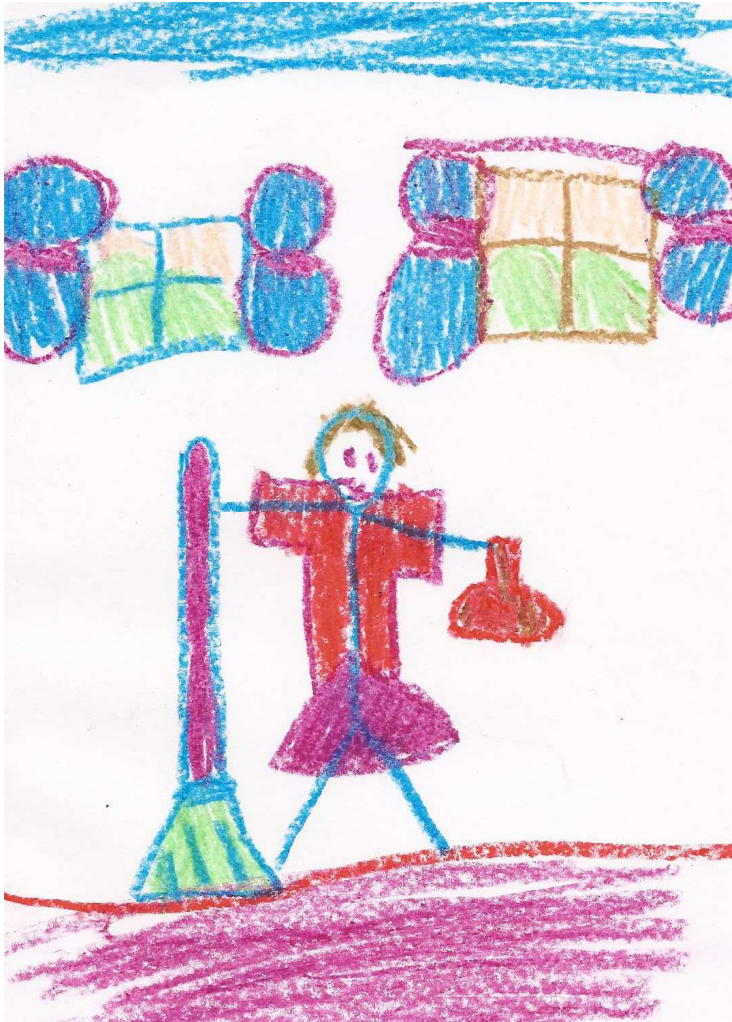
Today we sweep the floors.