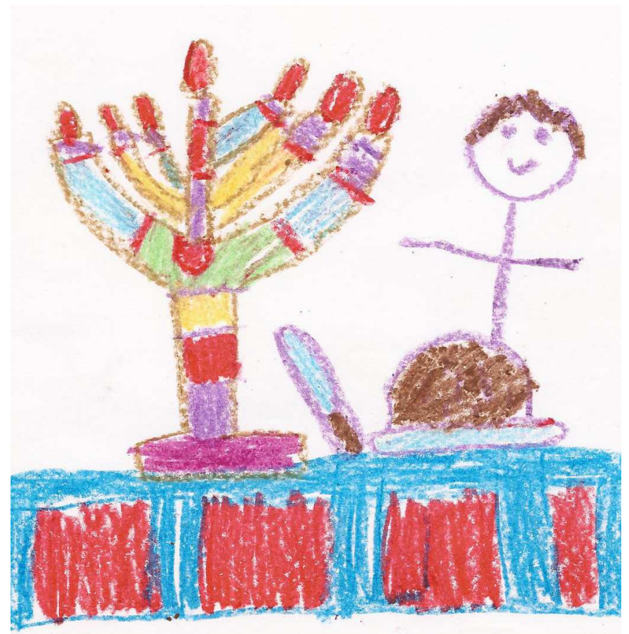
Shabbat is here!