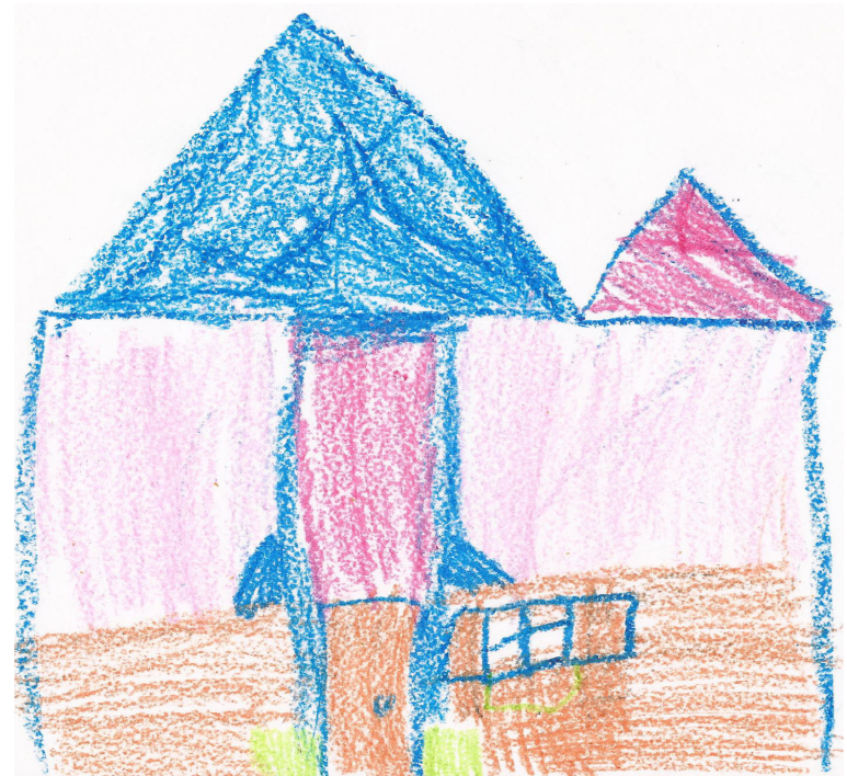
He gave me a house to live in.