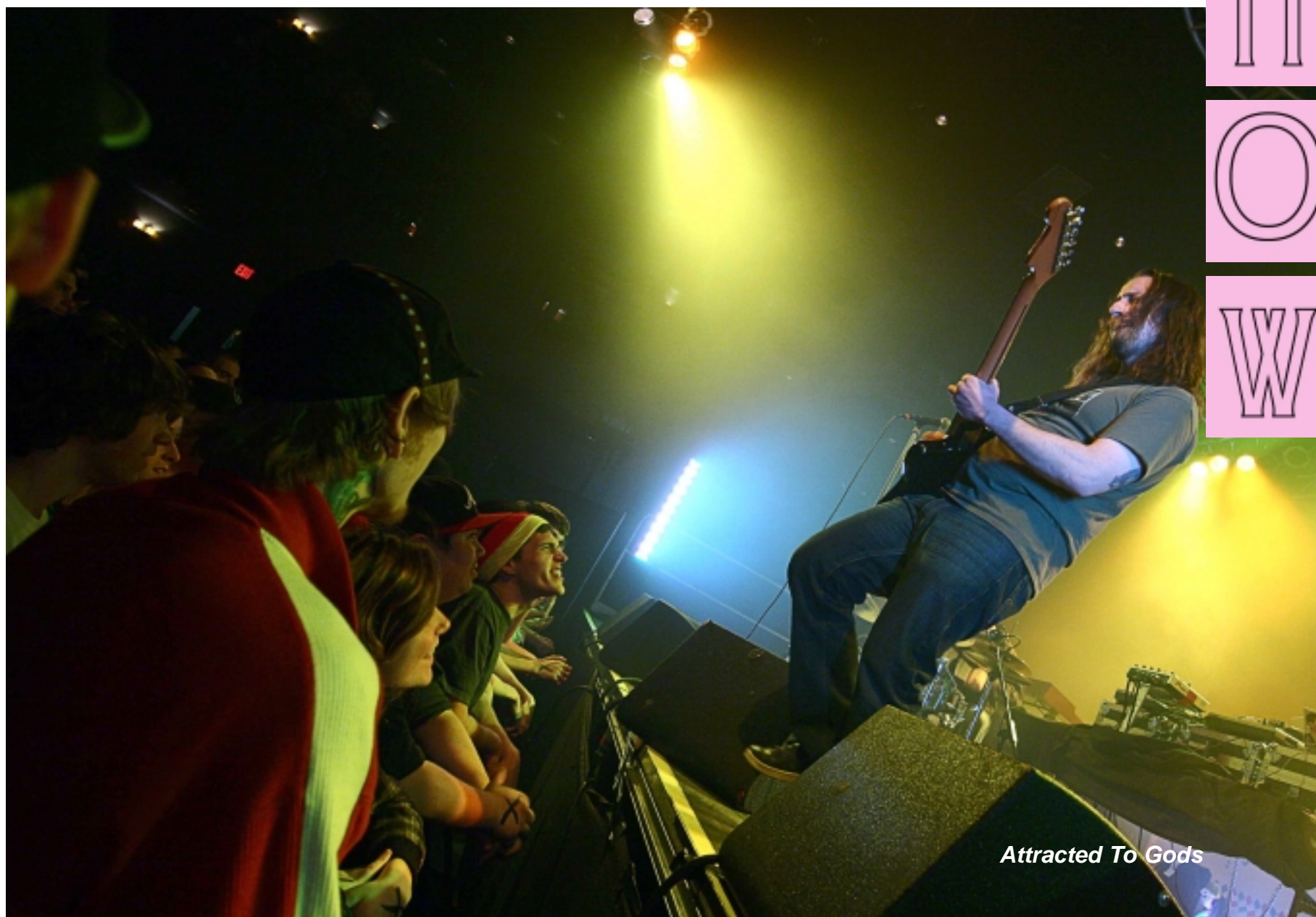
Attracted To Gods