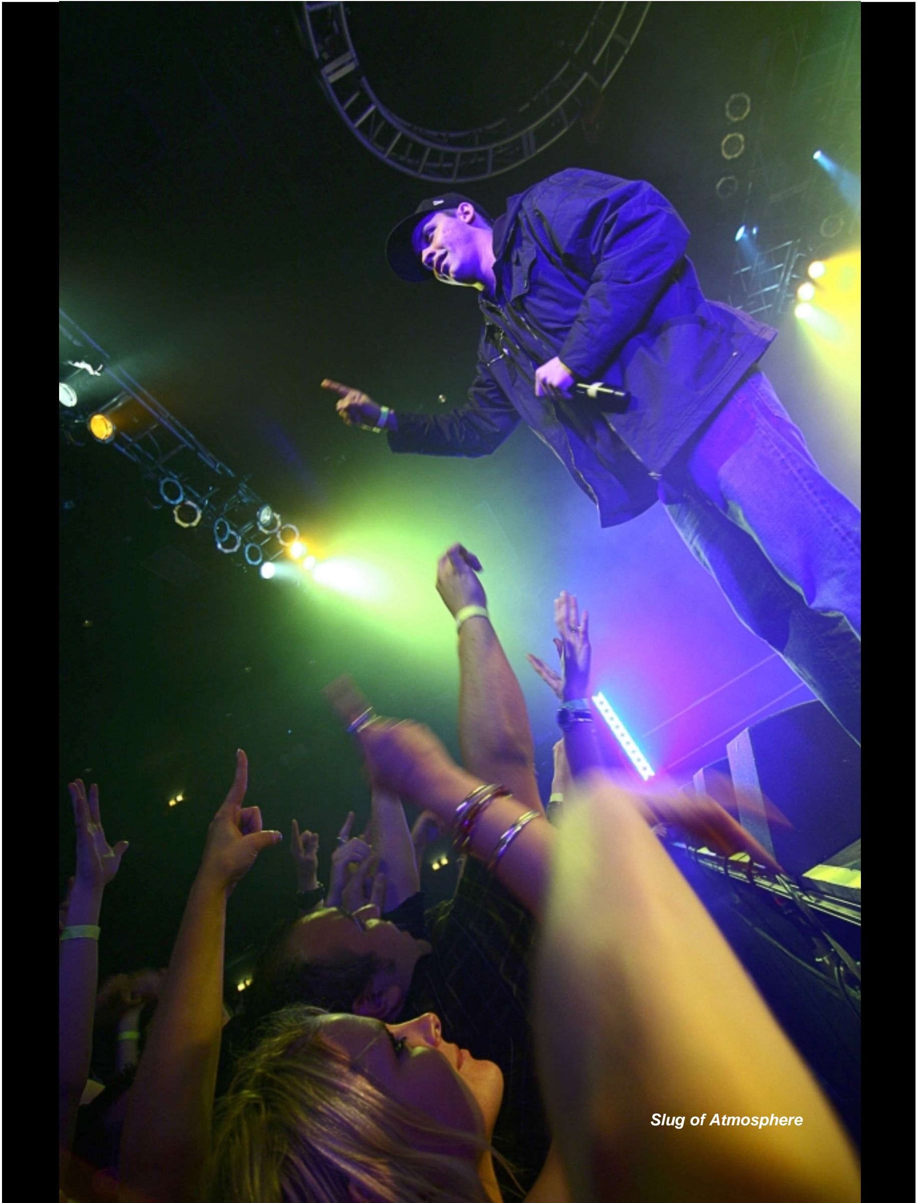
Slug of Atmosphere