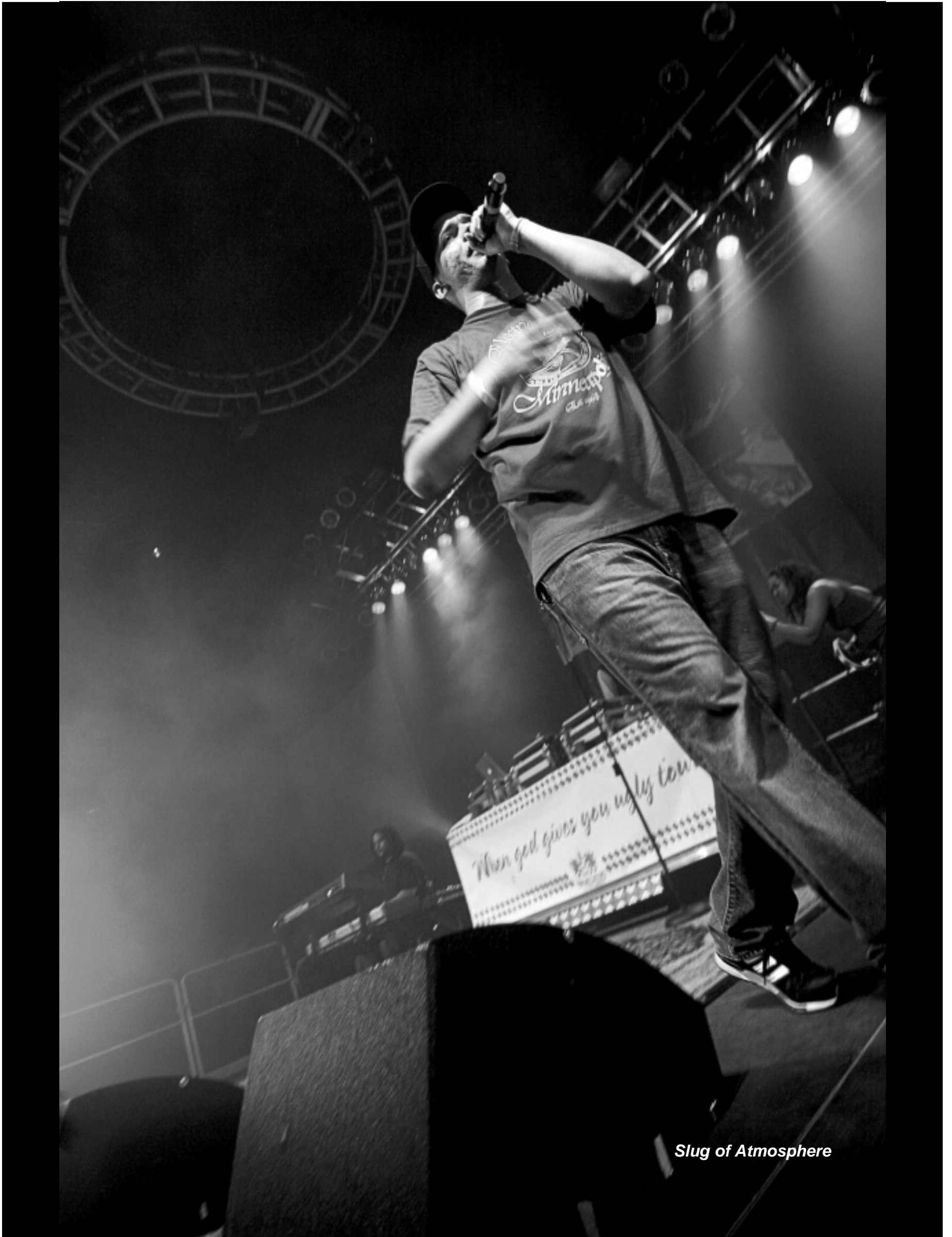
Slug of Atmosphere