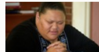
Pray for yourself and others, for our church and our land