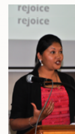
Be hungry for God's presence