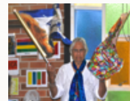
Call upon the Lord, dance, wave flags, blow the shofar