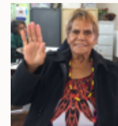
Hear God's word in the Bible