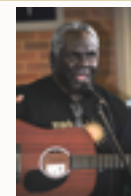
Sing to the Lord, worship God, declare God's goodness

The book can be downloaded for study for free from www.unitingprayerandfasting.com