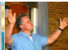
Give glory to the Lord... Call upon His name...