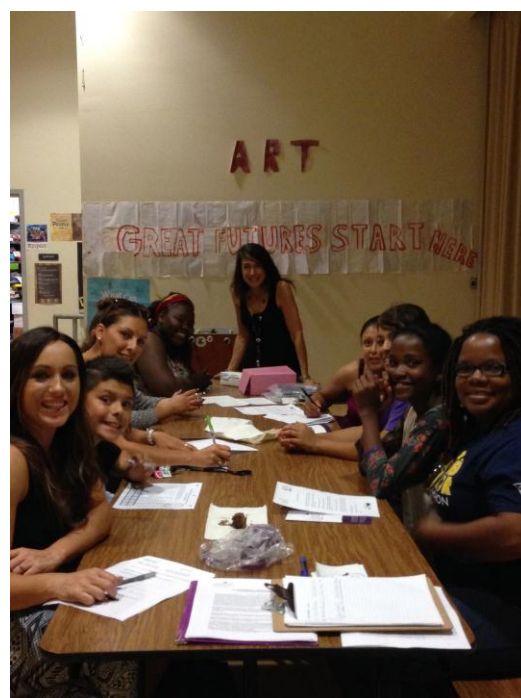
Student orientation at Rio Vista Middle School in Oxnard

The SEA Program starts every year with Mentor Trainings and Student Orientations. We ensure our mentors are well prepared to work with their students. All SEA Program participants learn about Emily, how doing poorly in school is not related to intelligence, and that with the right support, results can be improved. In addition, they learn about responsibility, not only for their school work, but in showing up for their mentoring sessions and ensuring they perform and post their good deeds for every mentoring session.