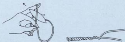
Figs 3(a) & (b) Roll tatting