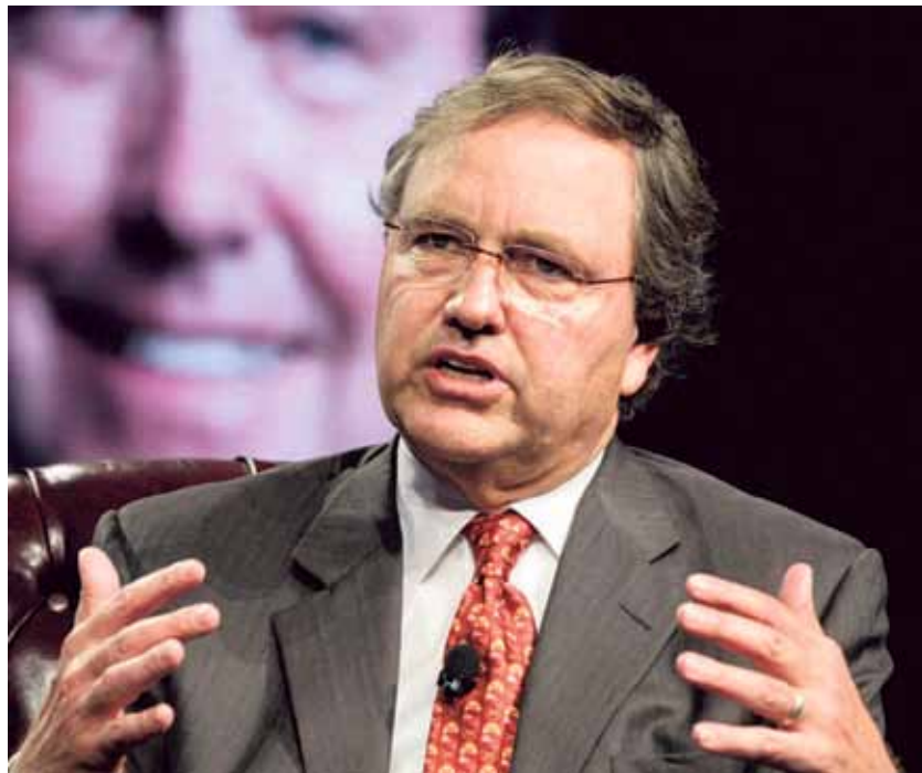
H. Lee Scott Jr.