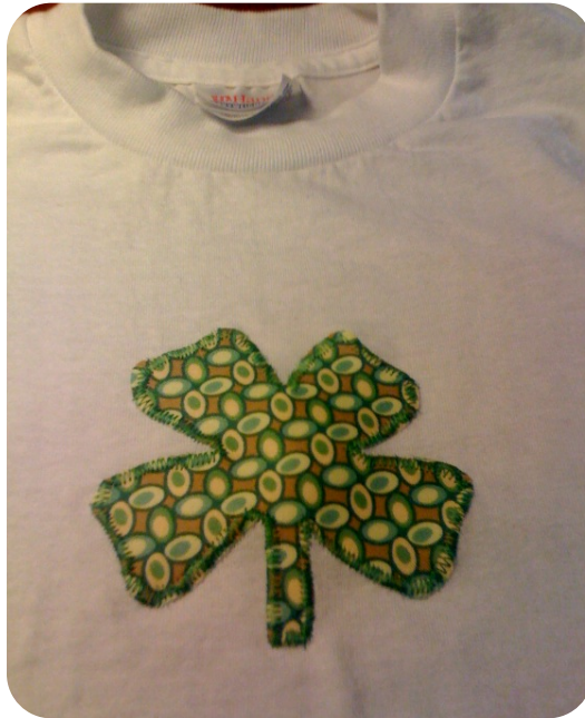
Luck O' the Irish 4 Leaf Clover Template and Instructions