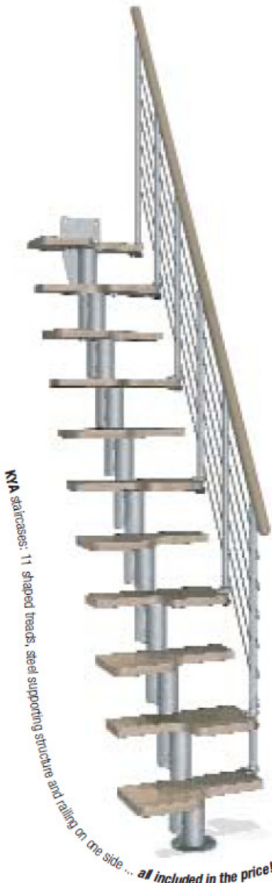
KYA staircases: 11 shaped treads, steel supporting structure and railing on one side ... all included in the price!

The Kya is a specialist space saving staircase that has alternating treads. The basic kit has 11 treads / 12 risers and can span to a height of 2820mm. The treads are in beechwood and the balustrade consists of vertical balusters, 7 horizontal stainless steel cables and a timber colored polyurethane handrail. Balustrade is included down one side as standard but can be purchased for the second side. Landing balustrade kits and riser bars are available.