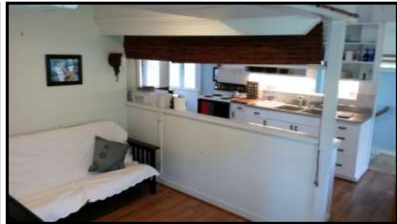
Living Room w/ 2 Queen Futons for additional guests.