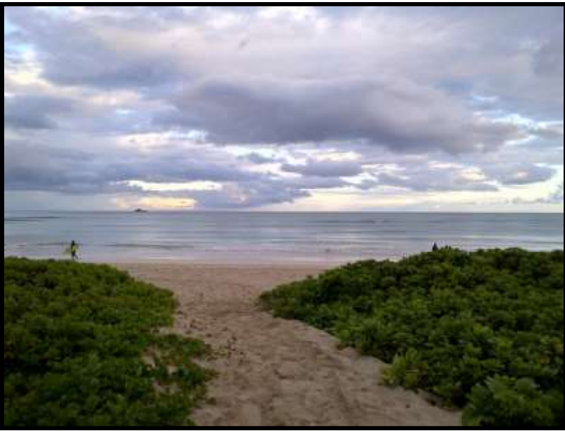
Beach Access shown (above).

President Obama and Family stay just down the beach during the Holidays.