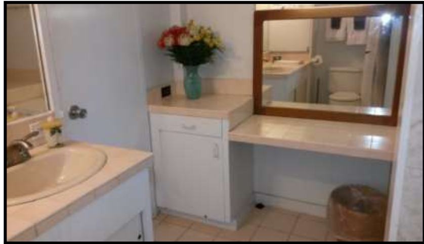
Bathroom with Bath/Shower (above)