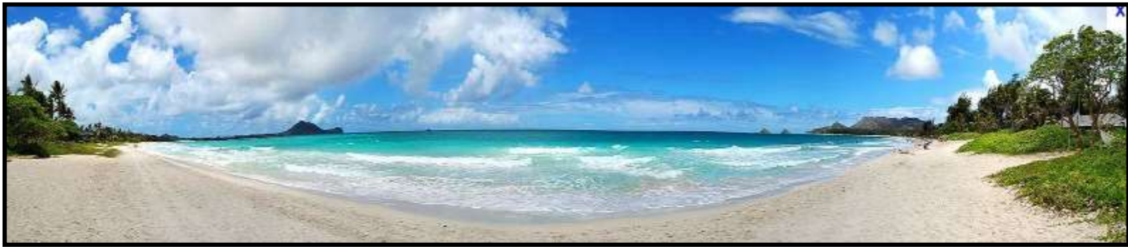
Panoramic of Kailua Beach