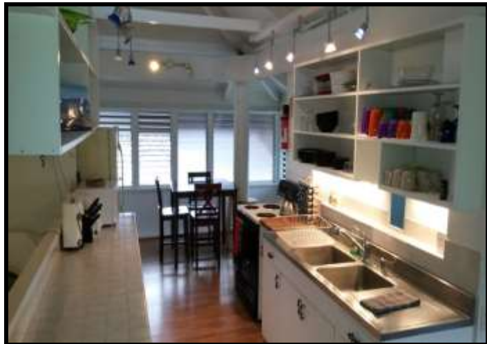
2 Dinning Areas on either side of the Kitchen