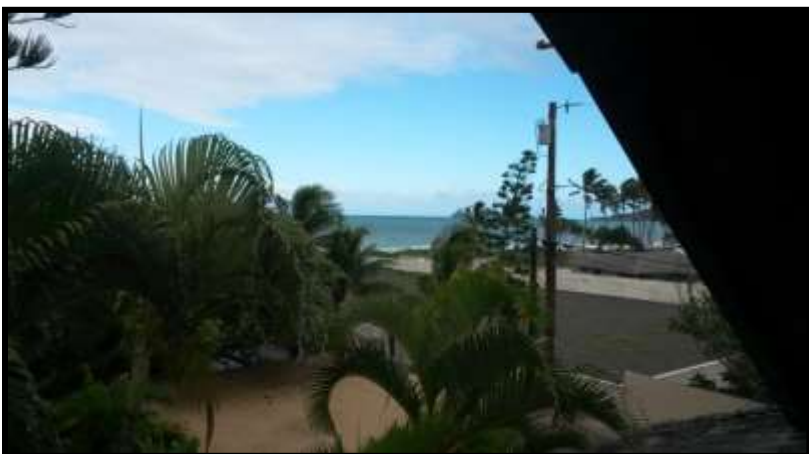
Ocean Views from the Master Suite