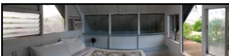
3 rd Floor Master Suite with King Bed

Has AC but you really won't need it. It's better to leave the windows open and let the waves lull you to sleep.