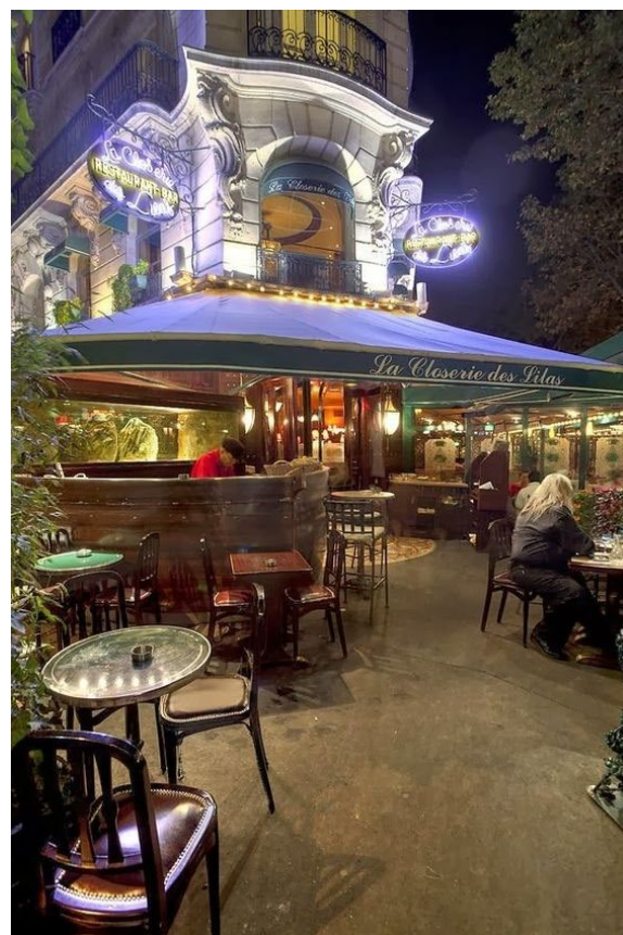
THE CLOSERIE DES LILAS

PRICE: $3957* per person (Based on double occupancy)