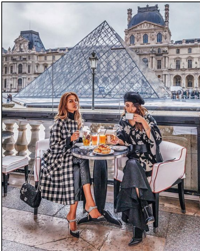
CAFÉ MARLY, OVERLOOKING THE LOUVRE