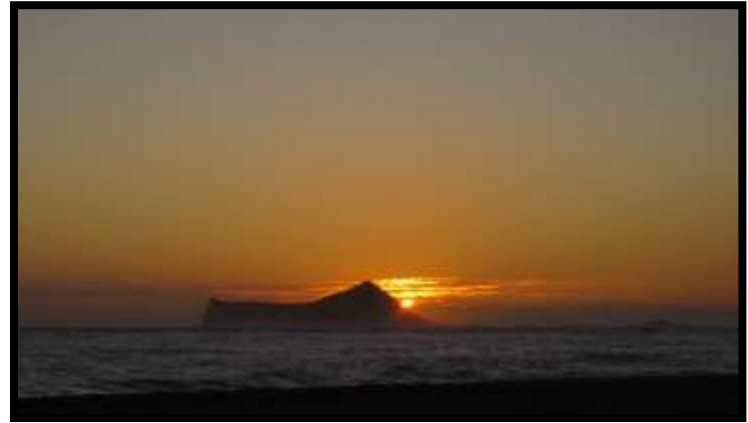
Everything you will need for the beach and fun in the sun: