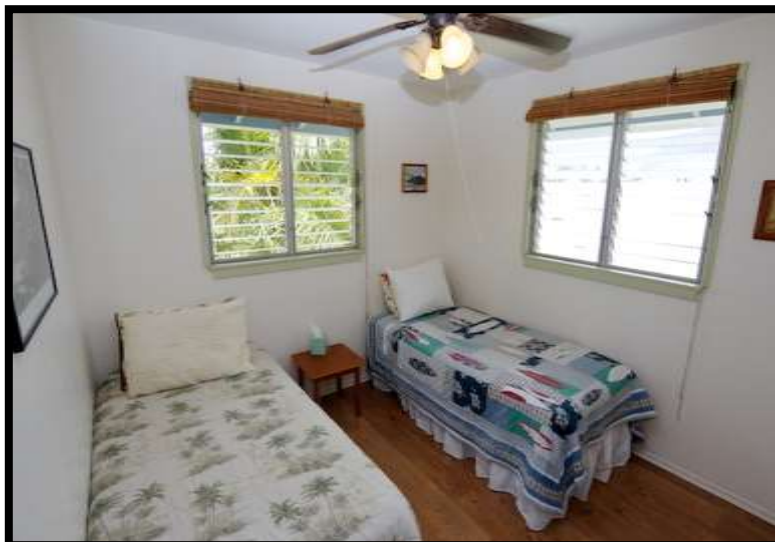
2 nd Bedroom w/ AC