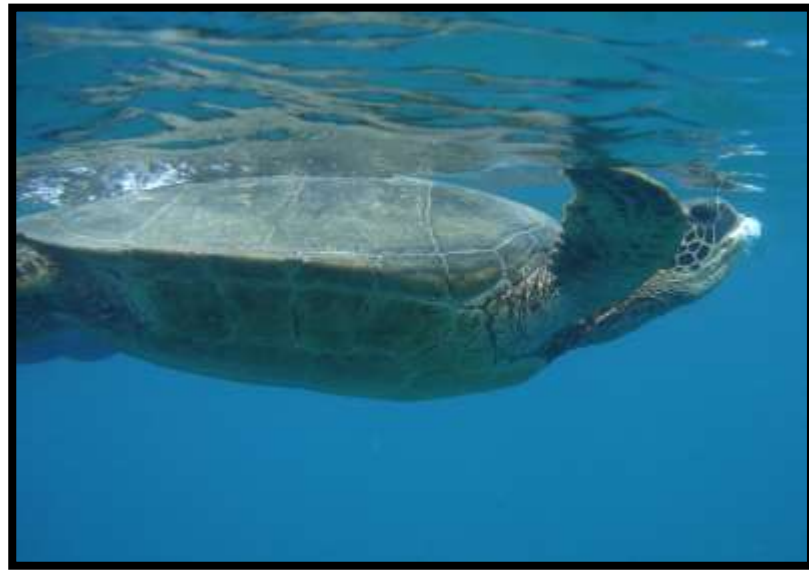
Endangered Hawaiian Green Sea Turtle on the Beach and just off shore.