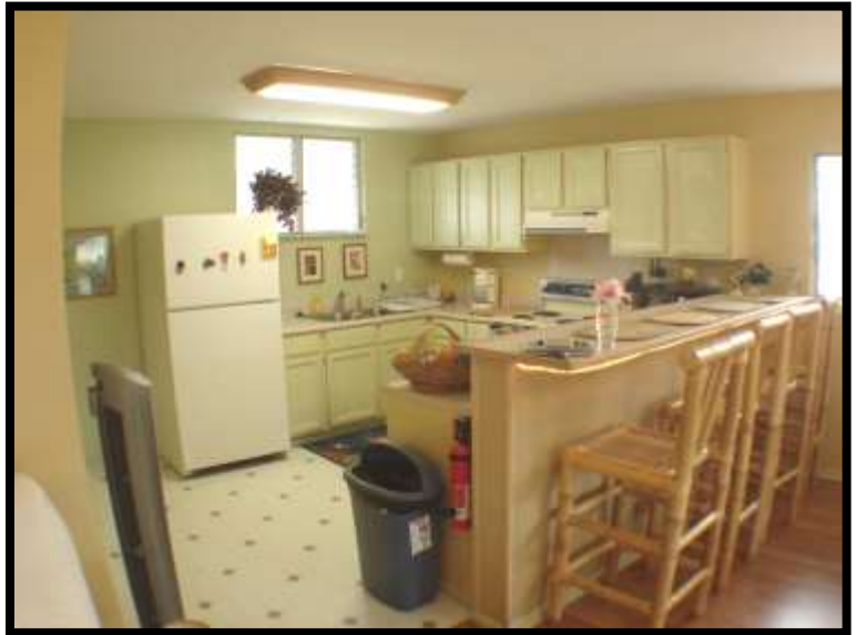
Full Kitchen and Bar