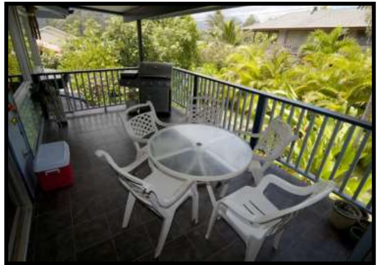
Lanai w/Gas BBQ