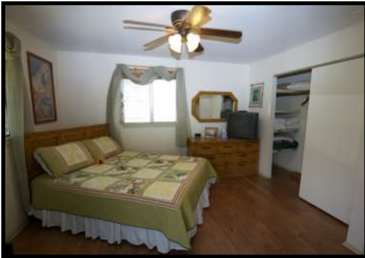
Master Bedroom with Queen Bed, TV, and AC