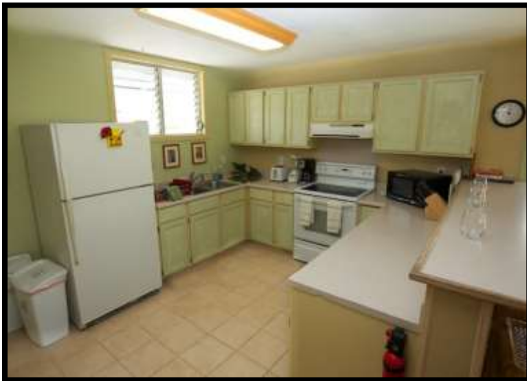
Kitchen has Everything you need and opens to Dining Room