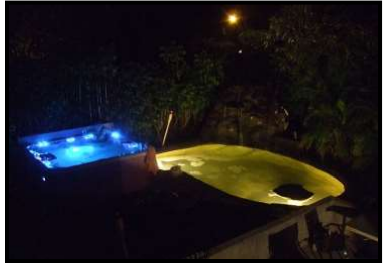
Hot Tub and Koi Pond