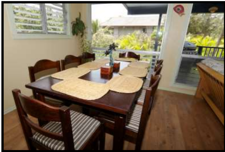
Dinning Room w/ seating for 8