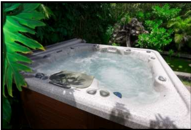
8 Person Hot Tub