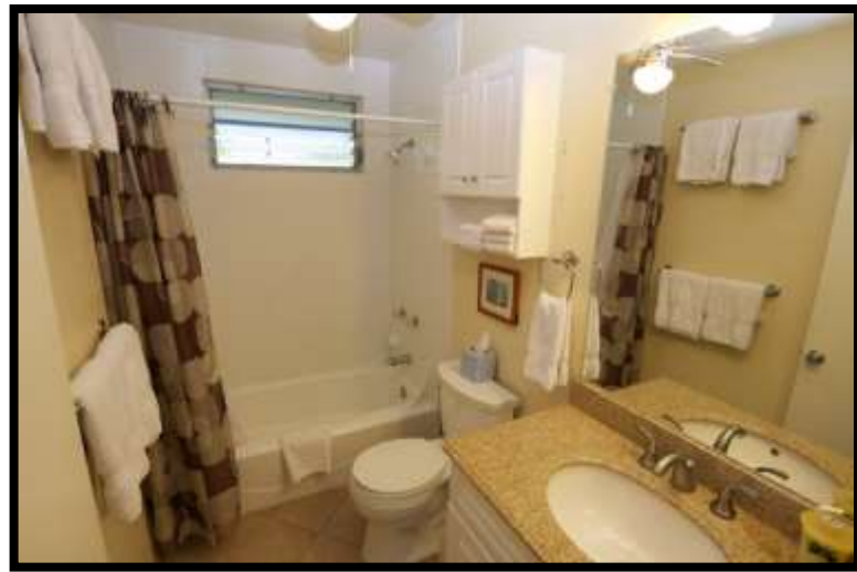
Full Bathroom with Tub/Shower Also an Outdoor Beach Shower with Hot & Cold Water