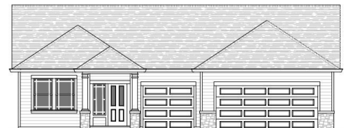
GERVAIS PLAN B-2