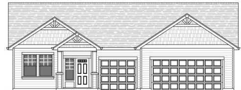
GERVAIS PLAN B-1