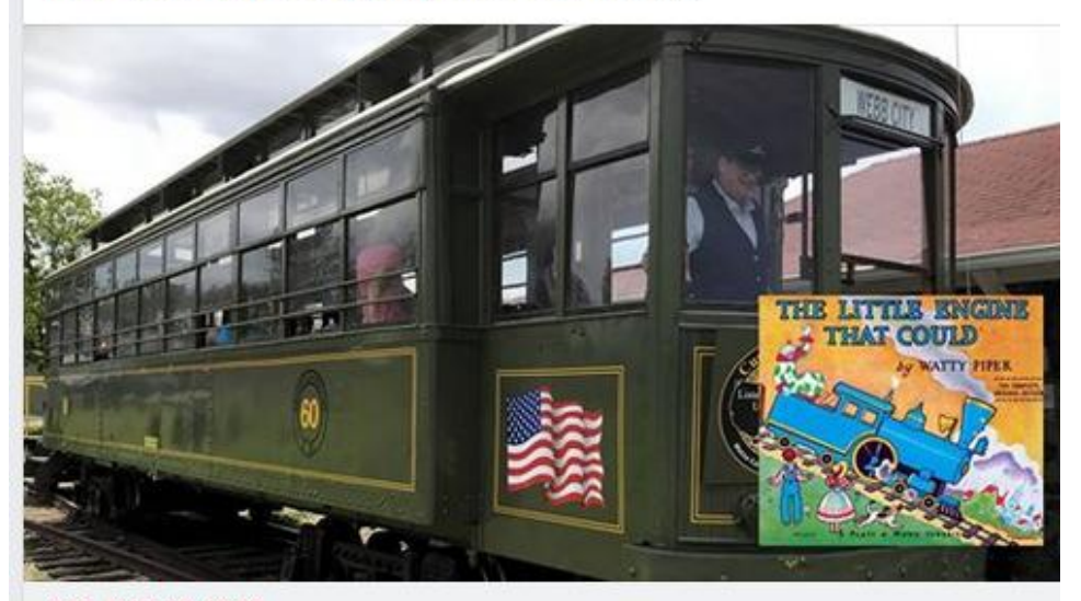
SAT, AUG 18, 2018 Clickety Clack - We're Reading Down the Track

All aboard Old No.60 for a free ride around King Jack Park. I think I can, I think I can, I think I can! This month, Clickety Clack features the children's classic The Little Engine That Could. Listen to the story, follow along in the library book placed on each bench. Make a paper engineer's hat at the craft tables. The streetcar pulls out of the station west of the farmers market every 20 minutes. Make a reservation to ensure a seat or take a chance on seats being available - they often are.