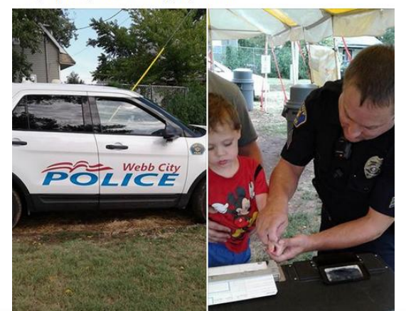
Finger printing for the kiddos going on now.

All aboard Old No.60 for a free ride around King Jack Park. I think I can, I think I can, I think I can! This month, Clickety Clack features the children's classic The Little Engine That Could. Listen to the story, follow along in the library book placed on each bench. Make a paper engineer's hat at the craft tables. The streetcar pulls out of the station west of the farmers market every 20 minutes. Make a reservation to ensure a seat or take a chance on seats being available - they often are.