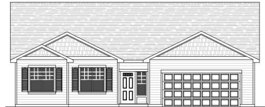
GERVAIS PLAN C-1