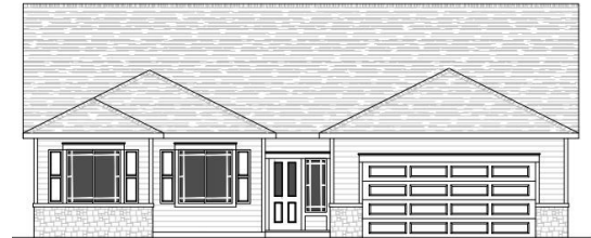
GERVAIS PLAN C-2