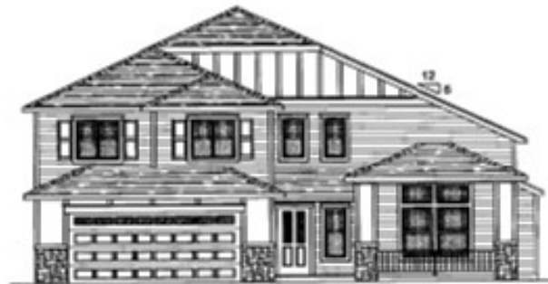
Front Elevation G2