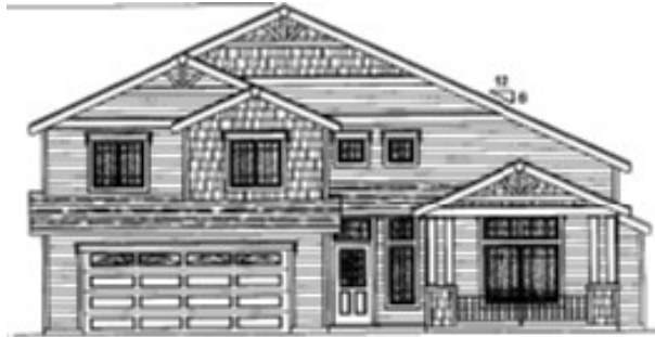
Front Elevation G1