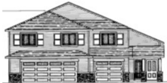
Front Elevation F2