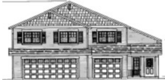
Front Elevation F1