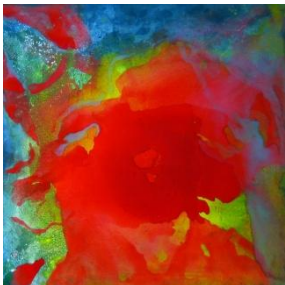
Rokeya Sultana, Relation 3 , 2009