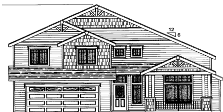
Front Elevation G1