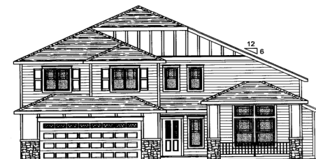
Front Elevation G2