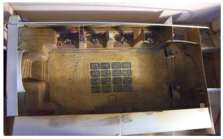
Looking down into the Throne Room, with the MDF box around it.

Secondly the room itself was constructed, and as it was a box diorama and therefore a forced perspective I wasn't too worried about the full 3D aspect.