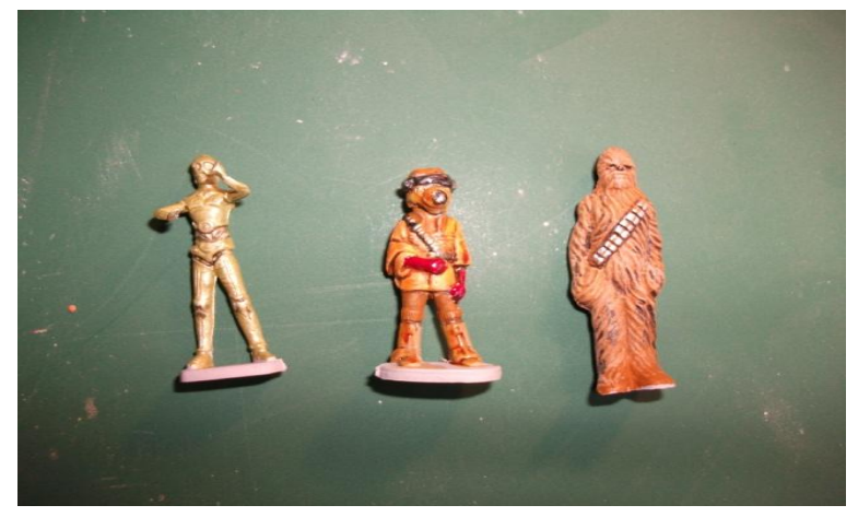
From left to right, C-3PO, Princess Leia/Boushh, and Chewbacca.

Finally, with the figures all painted, it was a case of adding the cast and crew to the scene and adding the ceiling and lights. The lights were all LEDs, in a parallel circuit, and wired up to a mobile phone charger and taped down.