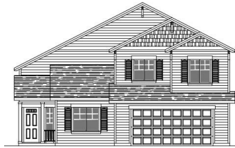
GERVAIS PLAN D-1