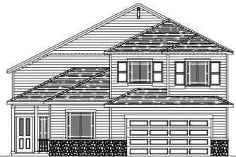
GERVAIS PLAN D-2