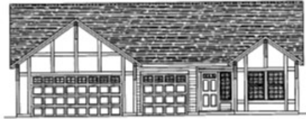
Front Elevation B1