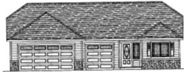
Front Elevation B2