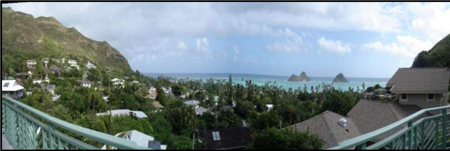
2 nd Floor Lanai where you can count the whales and watch the whales from the privacy of your Lanai.