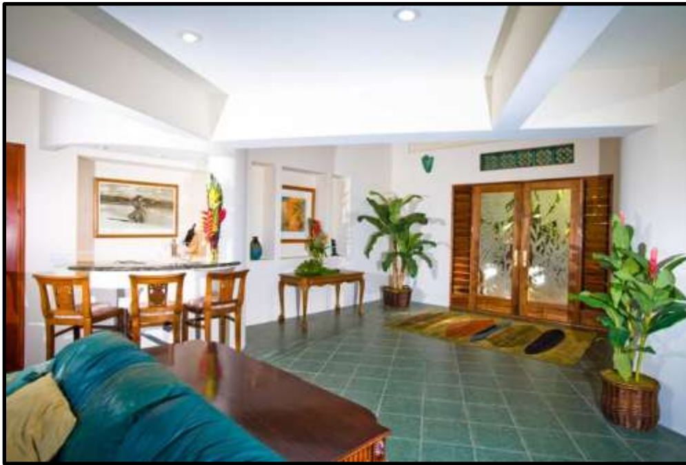
Entry and Bar Area