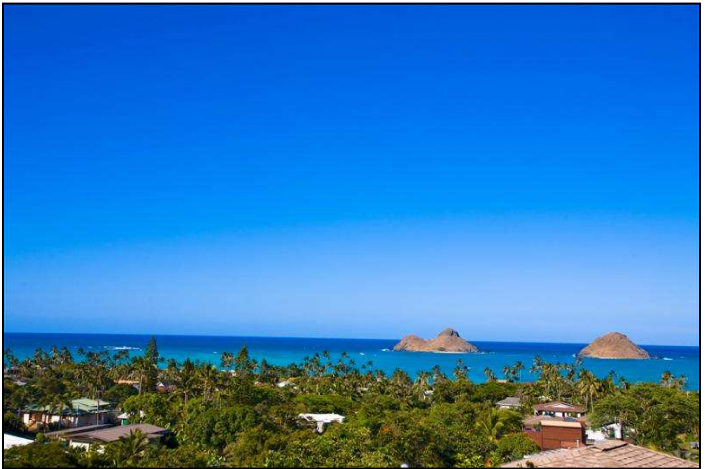
The View from the 2 nd Floor Lanai