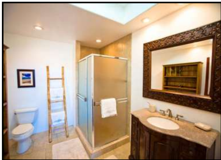
Upstairs Master Suite with Ocean View and Master Bath