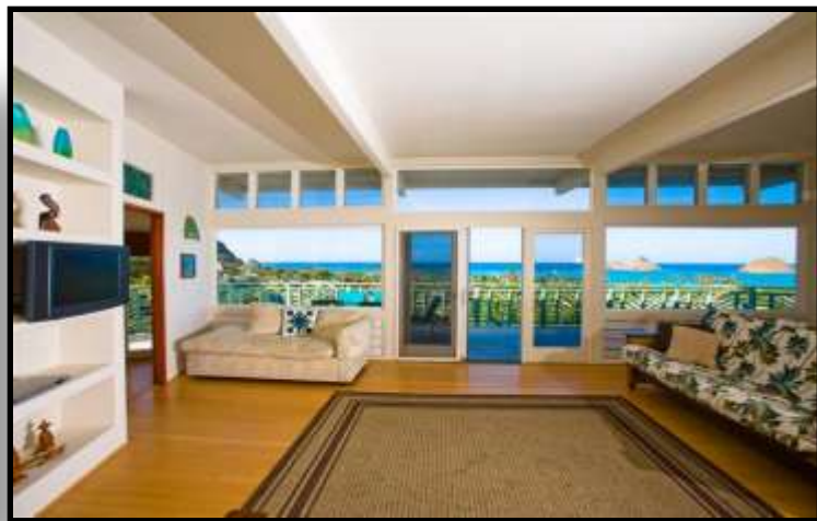
2 nd Floor Living Room with TV, DVD and an Amazing Ocean, Mountain and Sunset View.