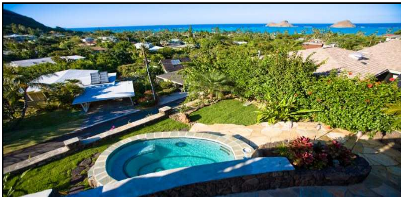
Splash Pool with Ocean View