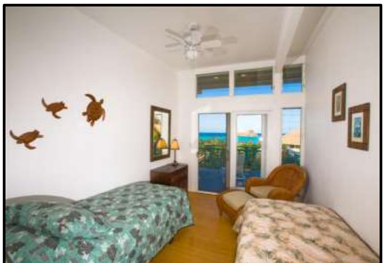
Corner Suite and Kids Room both with Ocean Views