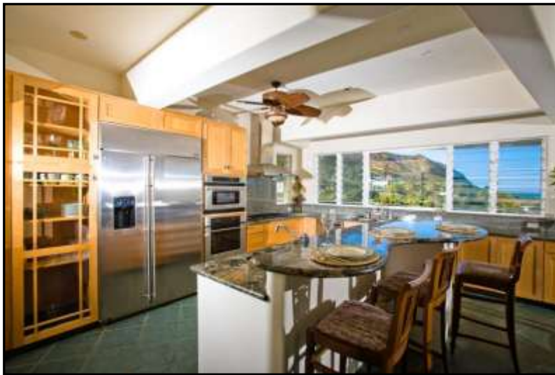
Gourmet Kitchen and Bar Eating Area

Yes, you even have Ocean Views while doing the dishes.