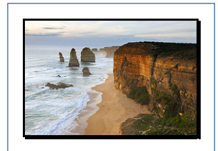
Twelve Apostles

The group's next challenge is due for launch on Australia Day, and it's aptly titled Australia - Our home is girt by sea .