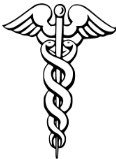
The Caduceus of Mercury (or Hermes) Symbol of Commerce