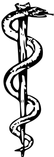
The Rod of Asclepius Symbol of Medicine