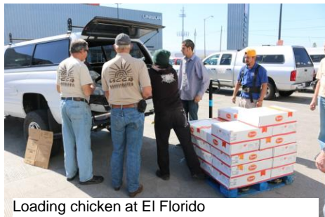
Loading chicken at El Florido

The March and April trips have gone very well. The inspection process at the border has gone well, and we're usually on our way with minimal delay. In the meantime, six trucks have already crossed the border