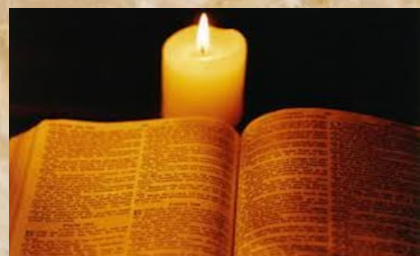
Bible Study B2 First Thursdays - 11am

You can message us on Facebook, or email us at hbey.hac@gmail.com