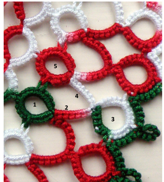
Order of working