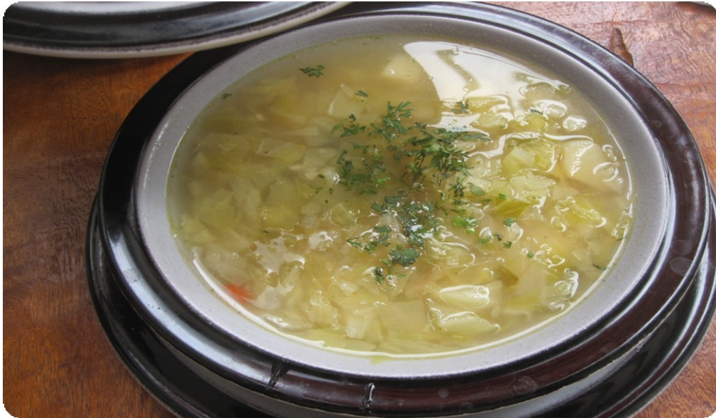
cabbage soup – La Quinoa lunch

La Quinoa has a nice ambiance as it is decorated very nice. The seating area is bright and airy. The owner of this restaurant is a pleasant Ecuadorian who sometimes also serves as waiter, and he happens to speak fairly good English. They have a full menu with reasonable prices; we've only eaten the almuerzo and have been satisfied all four times.