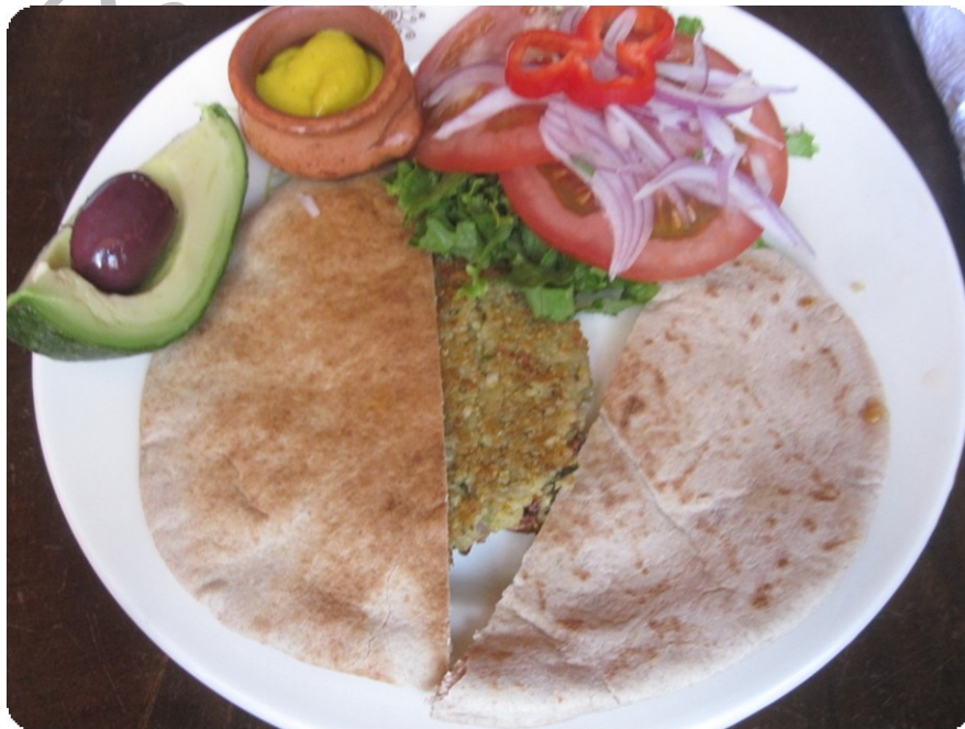
Nectar veggie burger in pita bread

Although some of the restaurants have started serving up smaller portions with the new ownership, such has Nectar Restaurant. But we eat a lot; maybe you don't.