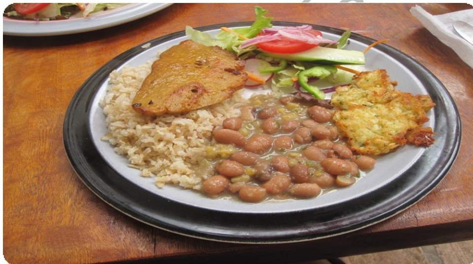
La Quinoa Restaurant – serves brown rice!

Near the end of this restaurant guide we add some of our other favorite Cuenca restaurants that may or may not be typical Ecuadorian almuerzo fare.