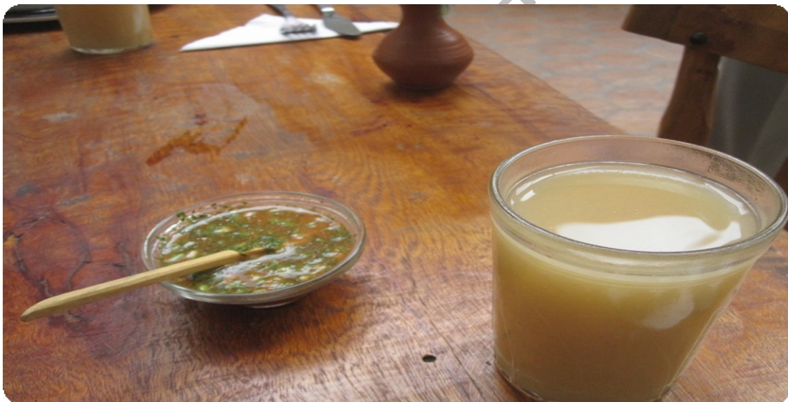
La Quinoa Special Aji Sauce

La Quinoa has a nice ambiance as it is decorated very nice. The seating area is bright and airy. The owner of this restaurant is a pleasant Ecuadorian who sometimes also serves as waiter, and he happens to speak fairly good English. They have a full menu with reasonable prices; we've only eaten the almuerzo and have been satisfied all four times.