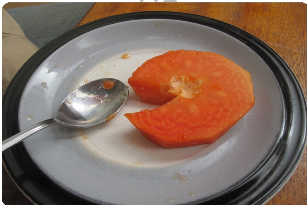
La Quinoa last almuerzo course of fresh fruit