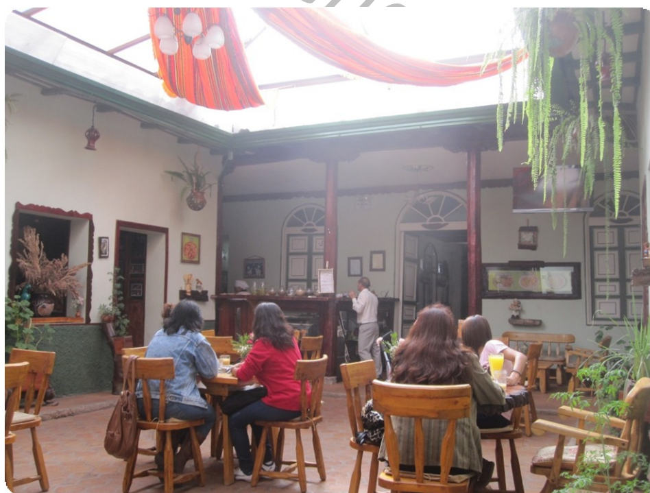
La Quinoa Restaurant