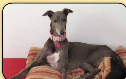
A New Life For An Old Grey