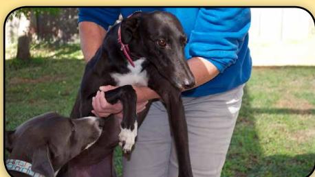
Two New Kids On The Block