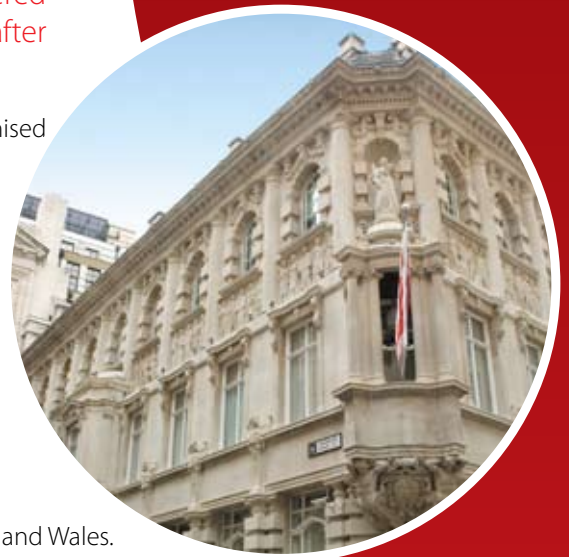
Chartered Accountants Hall, London

Many ACA members achieve partner or financial director status early in their careers.