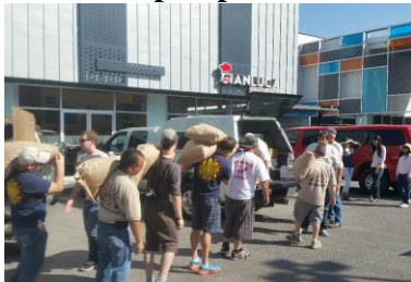
Everyone helps at El Florido

The last few trips have been interesting to say the least. The Mexican port of entry in Otay Mesa is undergoing a major construction project at this time. A few months ago most of the buildings that housed the offices of the