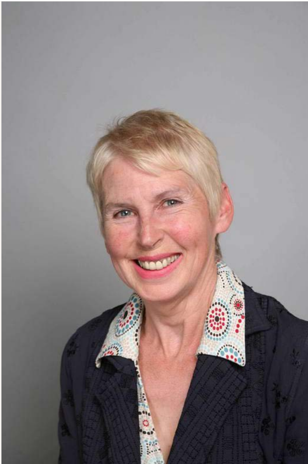
IRA councillor welcomed back to Tory bosom