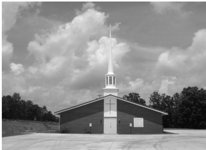
DANIELTOWN BAPTIST CHURCH – HOME OF DANIELTOWN BIBLE INSTITUTE