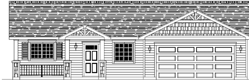
Front Elevation L1