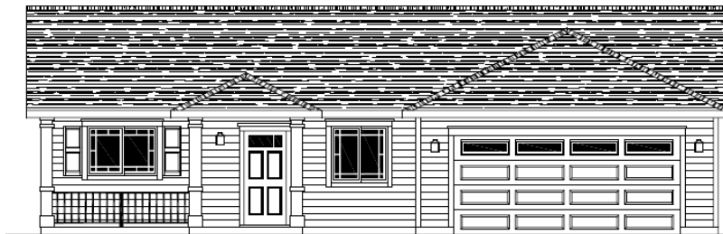
Front Elevation L2