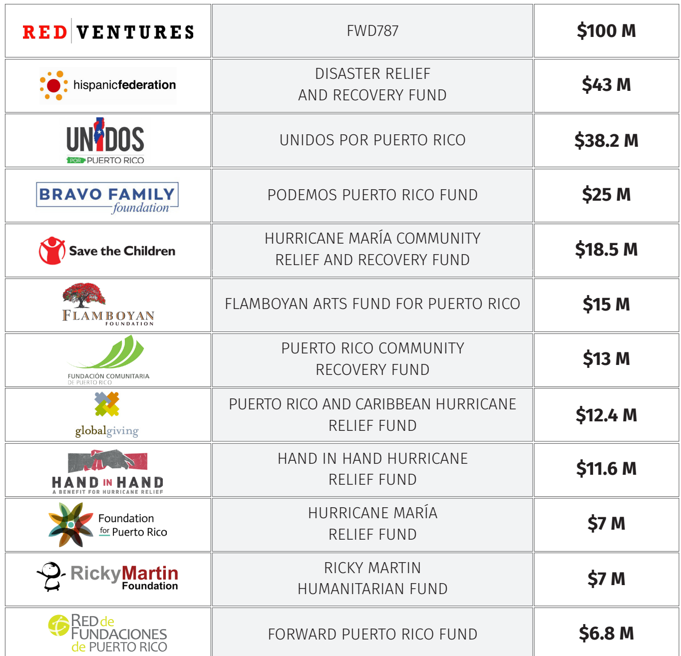
Table 1: FUNDS ESTABLISHED BY STUDY PARTICIPANTS (September 2017 - September 2018)