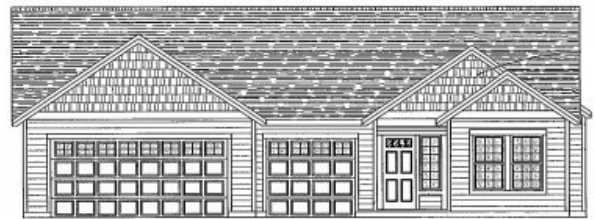
Front Elevation B1