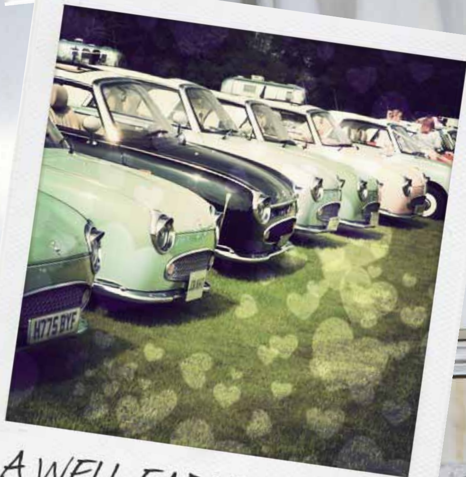
A WELL EARNED REST