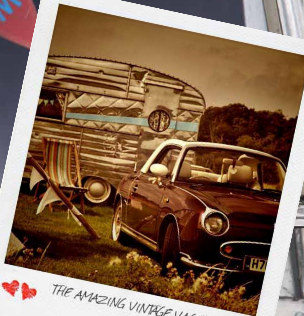
♥♥ THE AMAZING VINTAGE VACATIONS