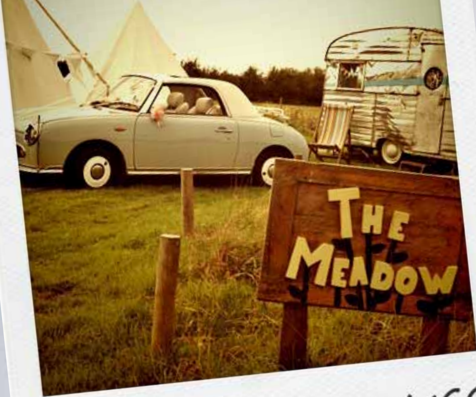
♥♥ WEDDED BLISS