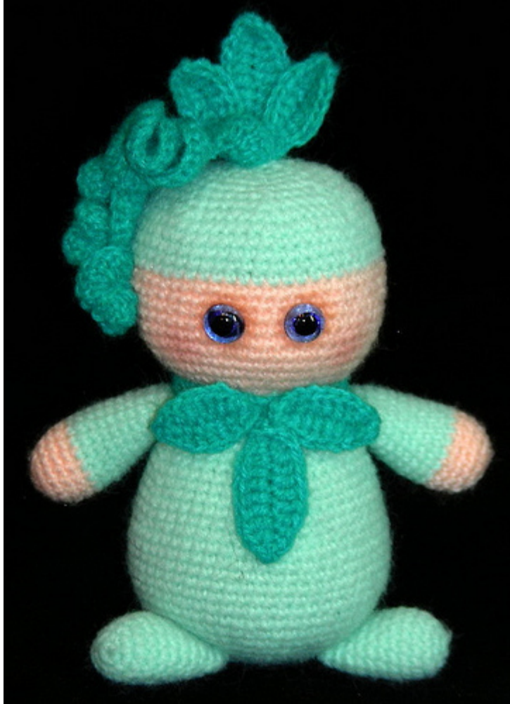
Little Pea Babe (4 inches) made by Zodwollop

If you want to turn your Pea Babe into a Girl here's how to do it !!!!!!!!