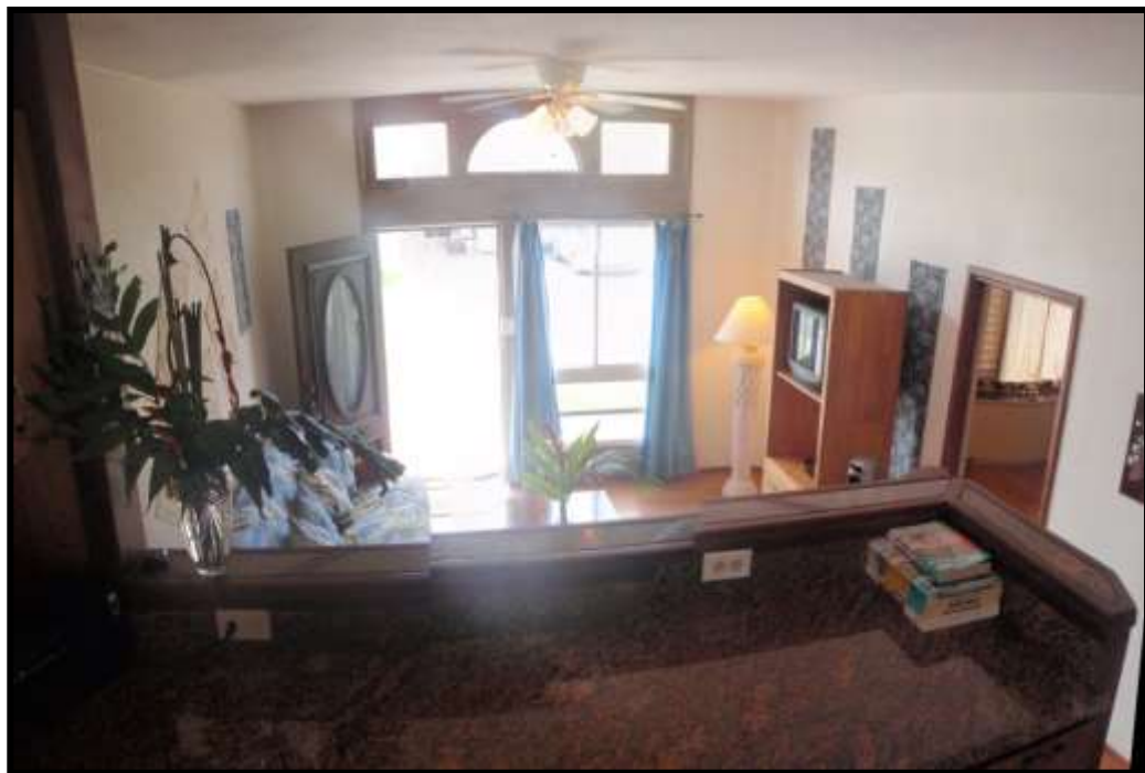
Living Room Shown from the Kitchen with Queen Futon for additional guests.