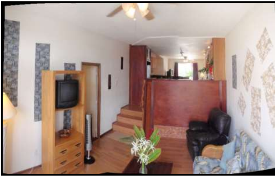
Living Room that opens to the Kitchen and has a queen futon for additional guests.