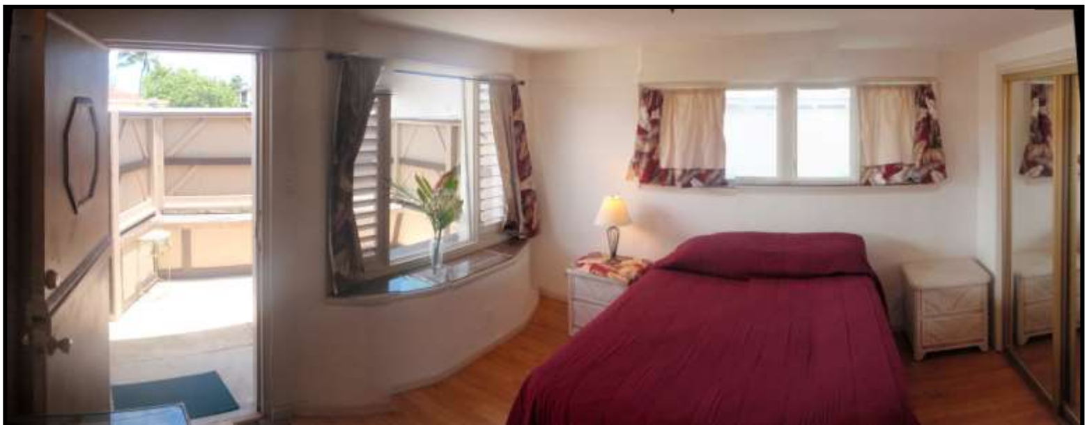
Master Suite w/ Private Enclosed Lanai