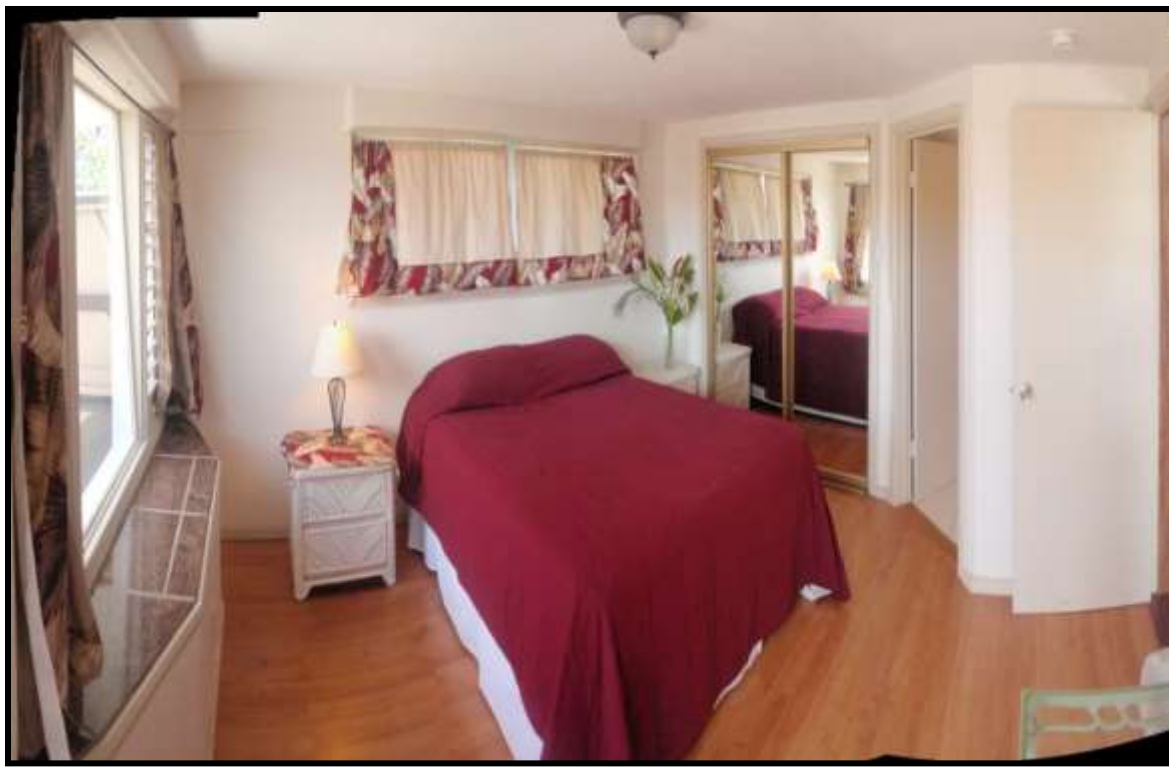
Master Suite w/ Private Bath and Lanai