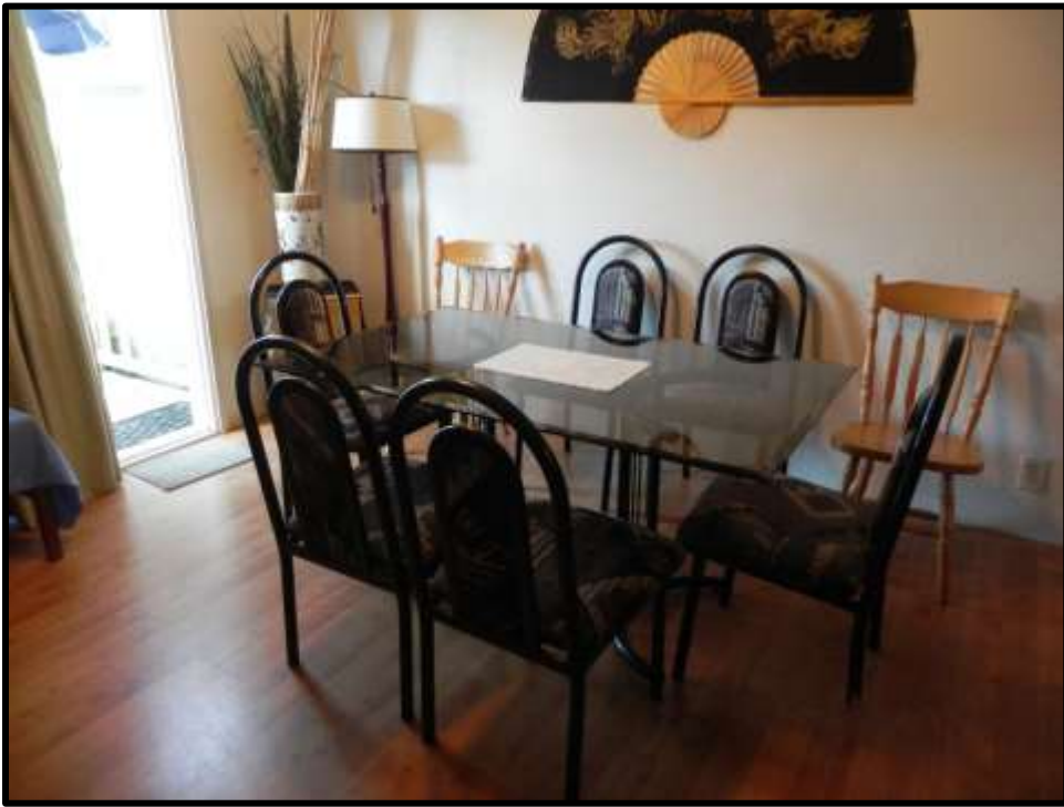
Dining Room Opens to the Kitchen Bar and Deck and Pool Lanai