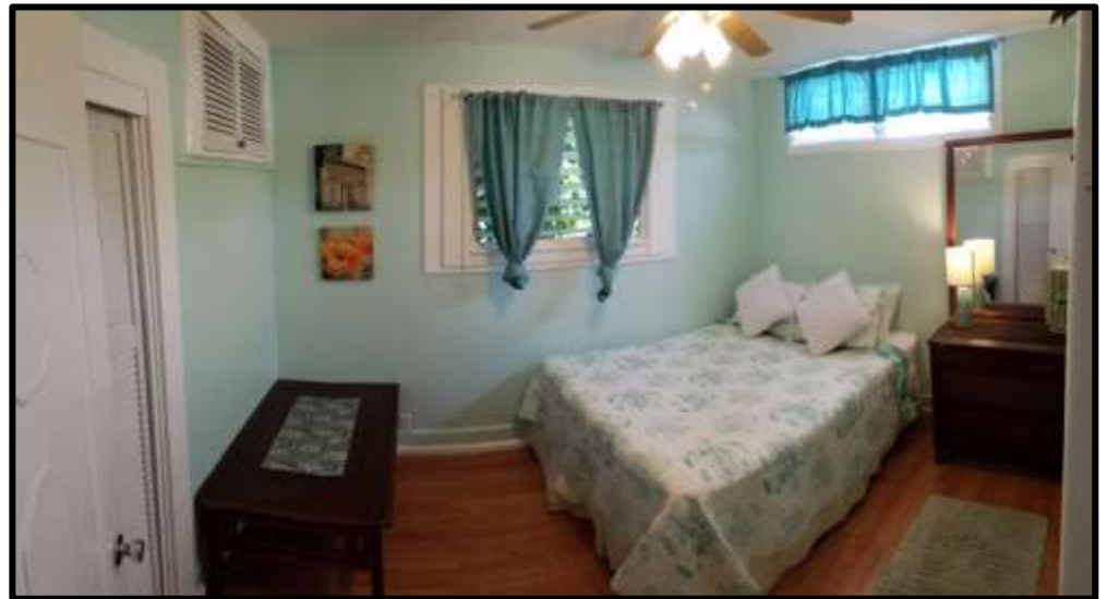
The Bedrooms are on the Windward Side and harness the cool trade wind breeze.