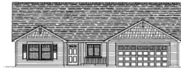
Front Elevation D1