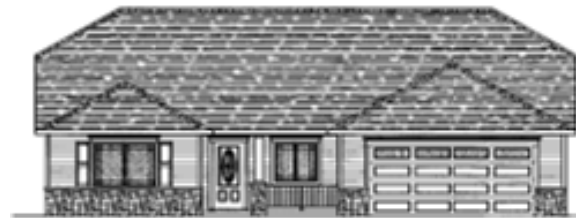
Front Elevation D2