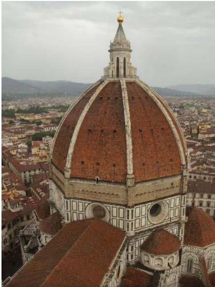
Florence, the Duomo