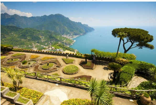
Ravello, on the Amalfi Coast