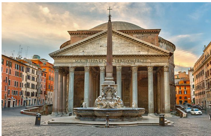
Rome, the Pantheon