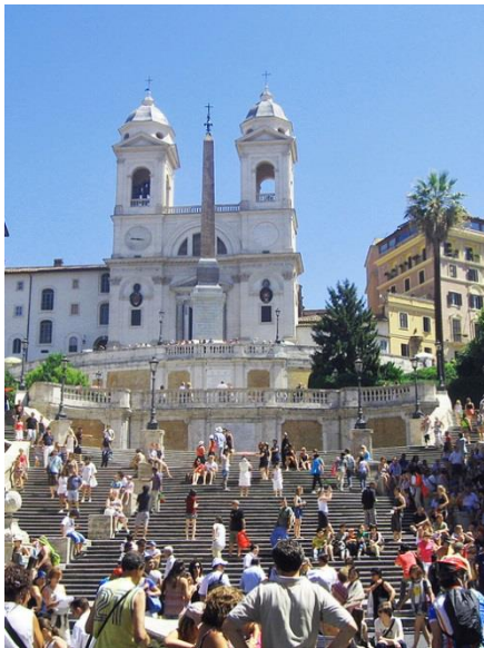
Rome, the Spanish Steps