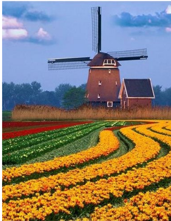
Amsterdam & Dutch Tulip fields