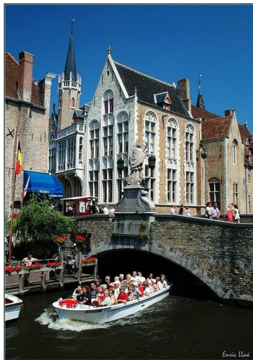
The fairy tale town of BRUGES