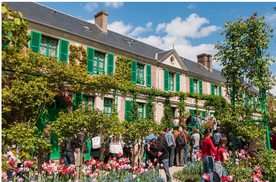
Claude Monet's Home & Garden at Giverny