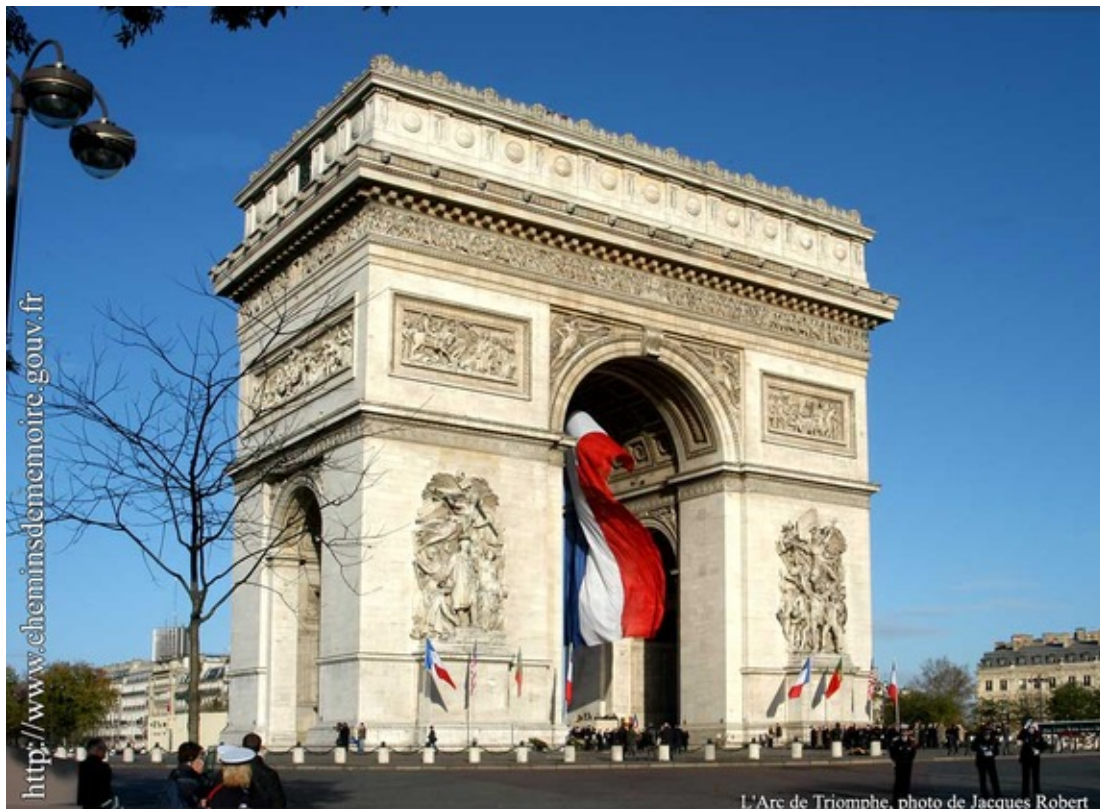
Paris, The City of Light