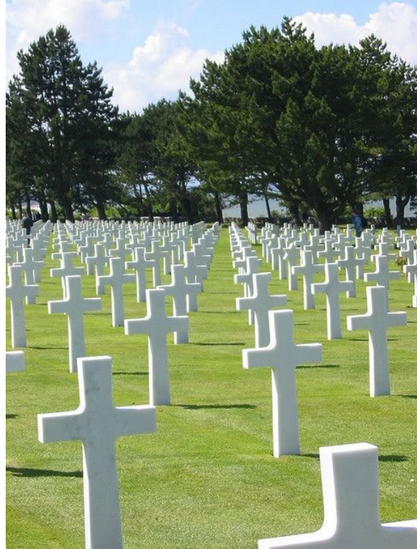
The half-timbered houses of Normandy & American Cemetery above Omaha Beach