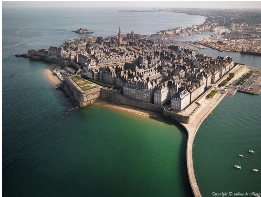
The Walled Town of St. Malo