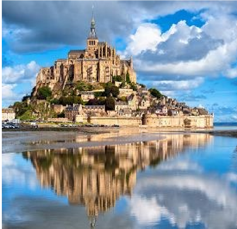
Mont Saint Michel