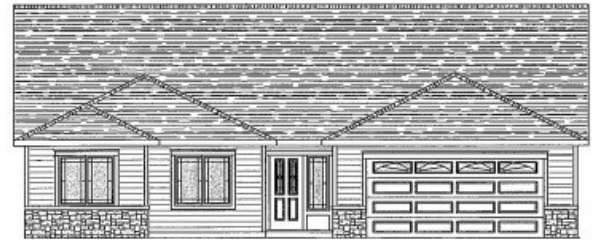
Front Elevation C2

The Chitwood Plan C-1767 4 Bedroom / 2 Bath Single Story Home 2 Car Garage *Optional Home Office 1767 Sq. Ft.