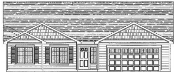
Front Elevation C1