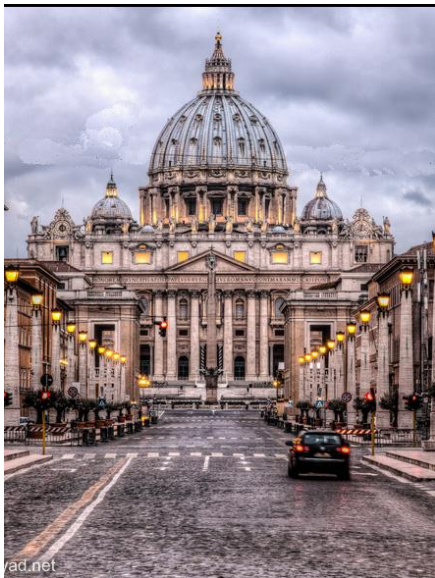
Rome, St. Peter's Basilica