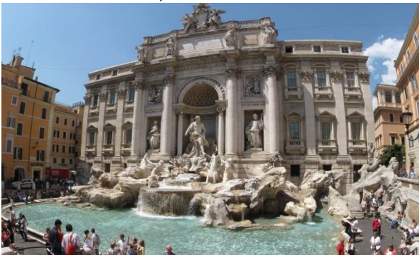
Rome, Trevi Fountain