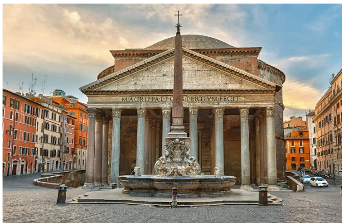
Rome, the Pantheon