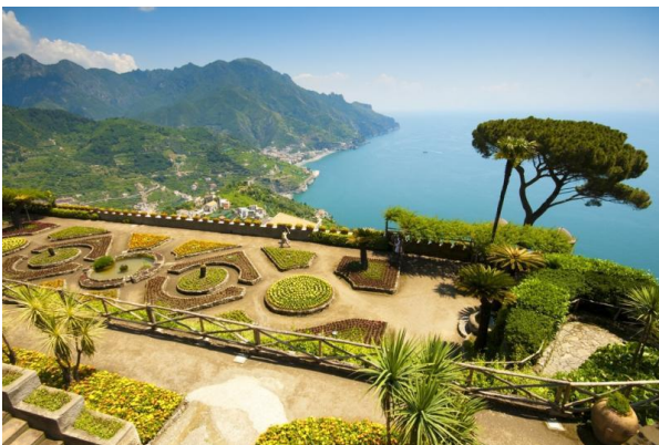
Ravello, on the Amalfi Coast