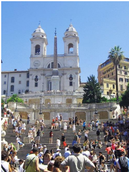
Rome, the Spanish Steps