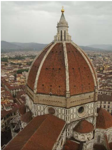
Florence, the Duomo