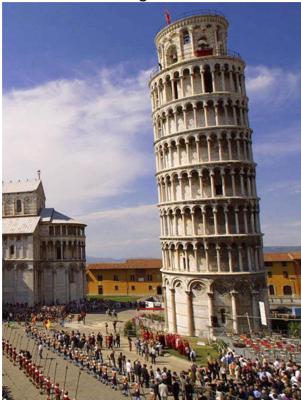
The Leaning Tower of Pisa