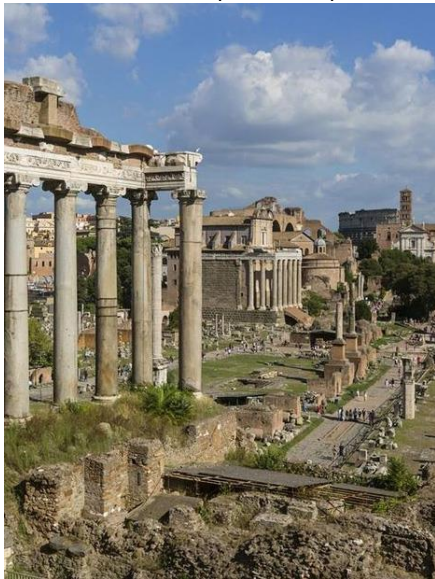
The Roman Forum