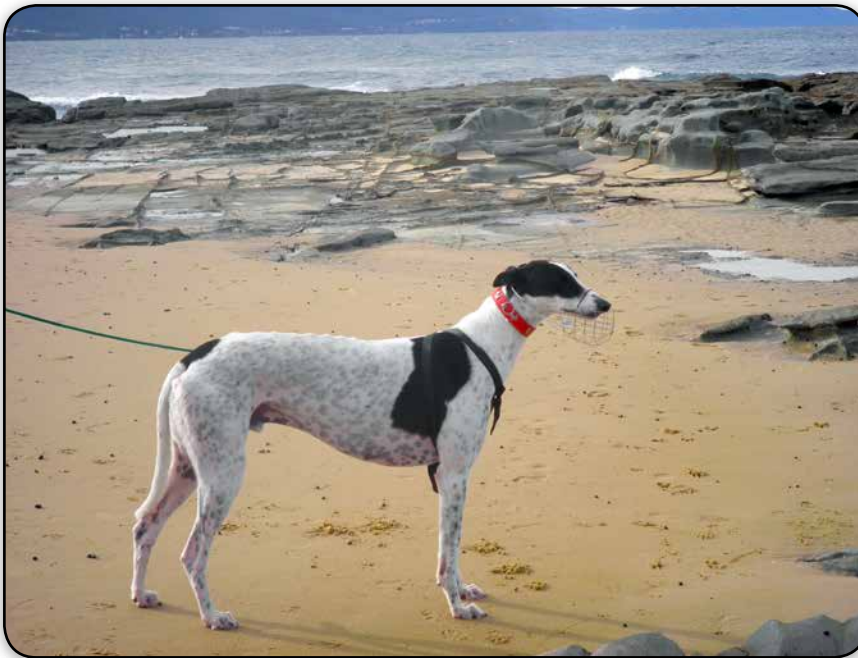
April 2012: Bobby at Bellambi Beach at Wollongong

our little picnic all along the rocks and close to the water. He made friends with passers by and was very impressive.