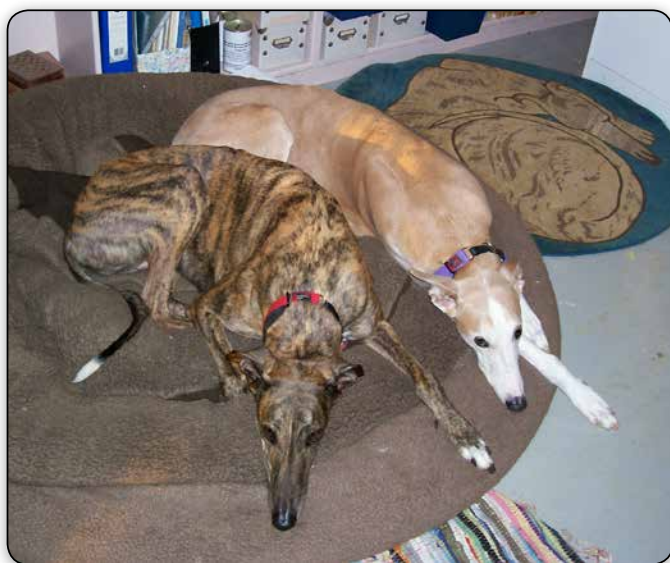
Tiger (a permanent foster for a family who could no longer look after him at their home) and Kane

The important thing to remember is that it takes time.