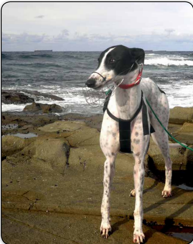
April 2012: Bobby at Bellambi Beach at Wollongong

Back to the kennel but not for long. We picked him up once again to take him to 'A Walk in the Park' at Centennial Park in Sydney. Aristocratic looking and lovable he found his permanent home that