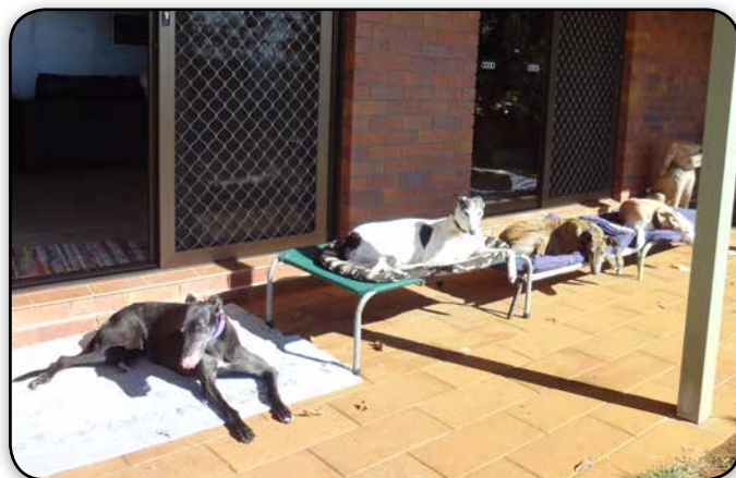
Heli, Angel (permanent foster for a lady who passed away), Tiger (permanent foster), and Kane

If you have any concerns or questions, contact your adoption group, or a reputable dog trainer or canine professional for advice. There are also some great books available on understanding dog behaviour. I have had good results from using Cesar Millan's methods, and I also use methods I have learned from several dog trainers, and a lot of research. There are many many great books around – it's about finding someone whose approach you like and that works for you. Most importantly, it's about having fun and enjoying time with your hounds!