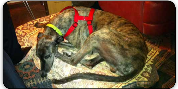
February 2012: Willow settling in well on his first trip to the mountains