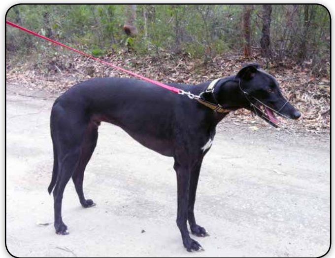
August 2012: Jimmy at Yellow Rock

When Jimmy arrived at our house for his short term foster I recalled that he was the first greyhound that I had brushed and chatted with while he was sharing the grass yard with Lady at the Box Hill kennel. At that time I would never have imagined that he would find his forever home with us and be our wonderful Jimmy. He