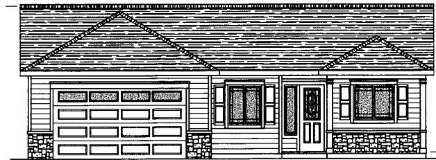
Front Elevation A2